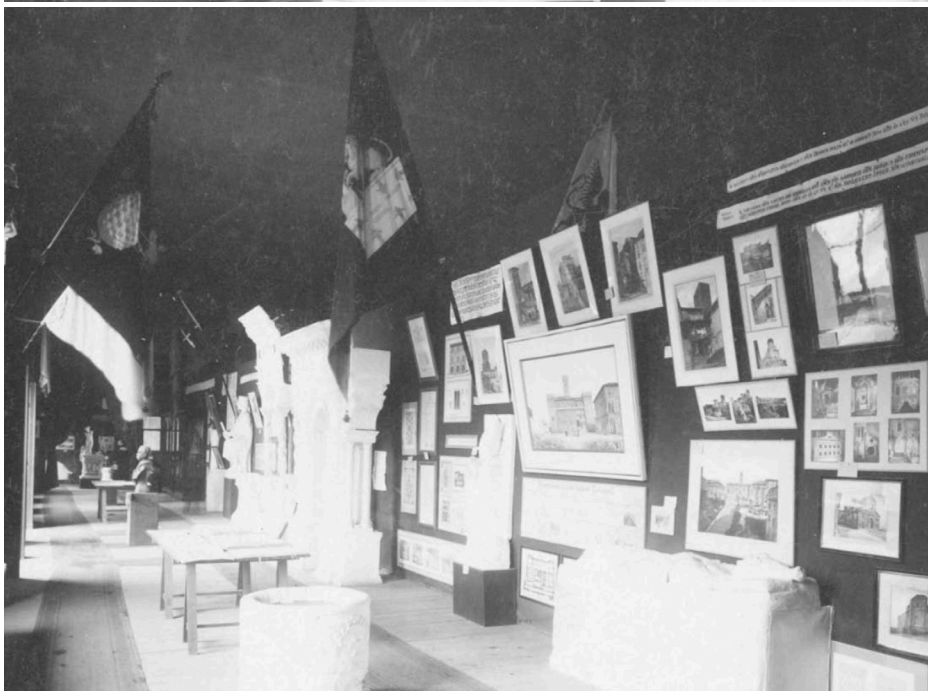
Fig. 3-4 - Two views of the Medieval section of the exhibition.