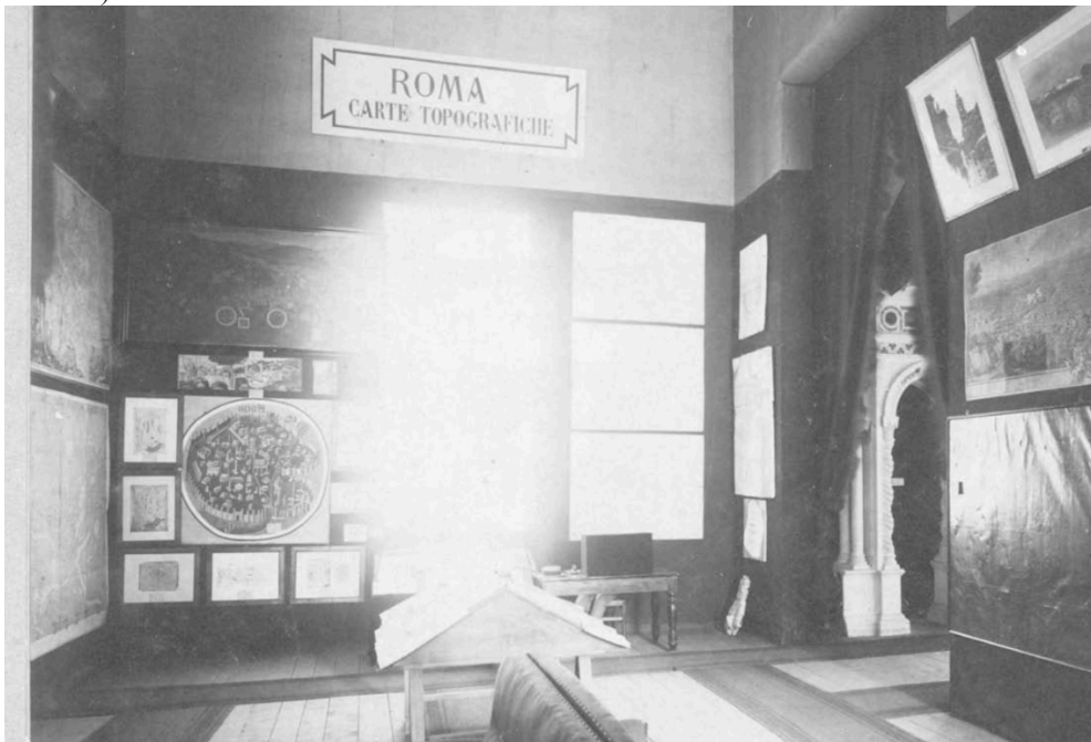
Fig. 2 - Part of the exhibition dedicated to the plans and maps of Rome (Archivio Storico Capitolino di Roma, Archivio Fotografico: su concessione della Sovrintendenza Capitolina – Archivio Capitolino).