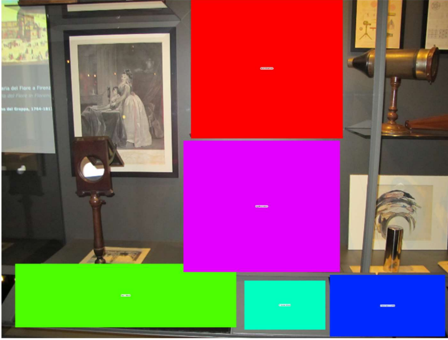
Fig. 1. Areas of Interests for the Optics showcase.

Concentrating only on four visiting areas and the corresponding showcases (Optics, Peepshows, Stereoscopy, Panorama) this experiment comprised two steps, namely the free observation of the four areas by museum visitors equipped with MET and a short questionnaire administered by one of our operators at the end of the visit. The experiment took place in January 2016 and it relied on the newly released Tobii Pro Glasses 2, the latest generation of mobile eye trackers. Recording at 50Hz, controlled remotely from a Microsoft Surface Pro 3 tablet, these eye tracking glasses yielded high levels of accuracy. Out of 20 visitors who spontaneously accepted to take part in the experiment, 16 provided very accurate data (88% recording accuracy) which were used for the analysis: 9 men and 7 women, their ages ranging from 18 to 60 (38 on average). After data collection, the team moved onto the data analysis, which was at the time particularly strenuous as the Tobii Pro Lab software was still in its infancy, being tested and improved by the Swedish manufacturer. The analysis was thus completed in June 2016 and, as is customary with eye tracking data, it was based on designing areas of interest to isolate the elements (objects, areas, tools) that were relevant for data extraction. Figure 1 shows how areas of interest were designed for the Optics showcase.