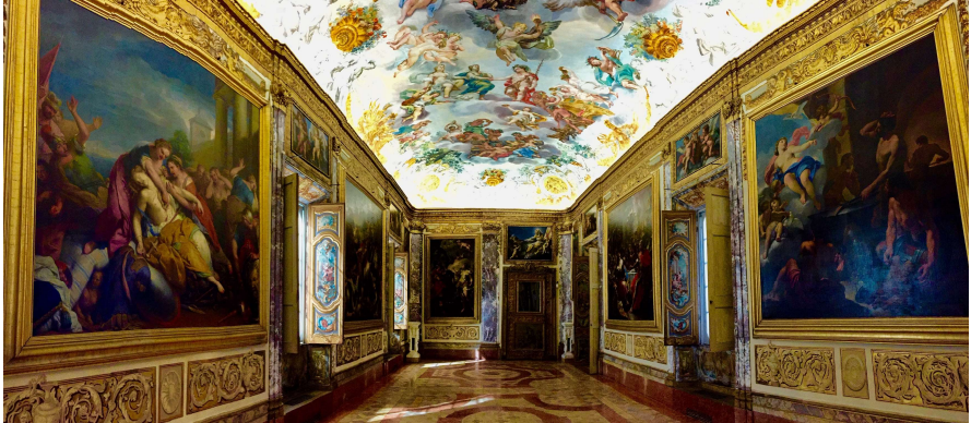
Fig. 3. Sala dell'Eneide, Palazzo Buonaccorsi.

museums and their visitors' behaviour with MET. Thus, after the first experiment in Torino, whose museum is often chosen by visitors for its recreational nature, a more traditional museum was selected, different in many respects. Palazzo Buonaccorsi in Macerata hosts three different collections on three floors, it is located in a significantly less touristy town if compared to Torino, and its peak features are in the so-called piano nobile , the best known and beautifully decorated part of the palace, which constitutes an exhibit per se and hosts the Ancient Art collection. With the museum managers, a decision was made to concentrate on two sections of the piano nobile , both featuring various information tools but differing in artistic content and structure: the Sala dei Catenati (Catenati room), is a rather small space dedicated to the Accademia dei Catenati, whose coat of arms appears in the room along with 25 paintings celebrating the seventeenth century members of this prestigious society.<sup>3</sup> The Sala dell'Eneide (Eneide room), on the other hand, is a fully decorated, eighteenth century masterpiece with painted ceiling, doors and windows, enriched by large, framed paintings hung all across its four walls. Figure 3 below shows the Sala dell'Eneide.