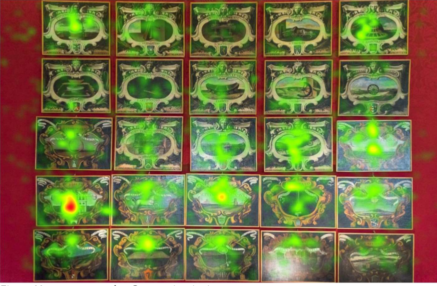
Fig. 4. Heatmaps on the Catenati paintings.

In the Catenati room, the user experience analysis yielded even more interesting results: virtually all participants (16 out of 17) entered the room and quickly scanned the 25 paintings, generally focusing on the fourth line from the top, with five paintings which are placed at eye level. Figure 4 shows the 25 Catenati paintings, with heatmaps from eye tracking analysis.