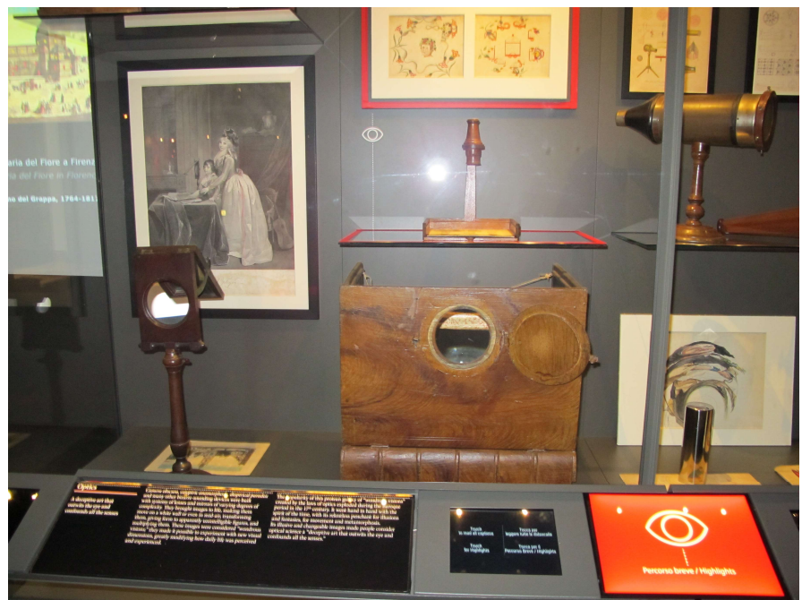
Fig. 2. The Optics section and its main information tools.

Before presenting some results, let us focus on the main hypothesis which guided this experiment, i.e. that the four areas of the "Archaeology of Cinema" section offered too much informative material and too many options: dark, backlit panels with long texts in two languages at the bottom of each showcase; embedded, interactive tablets; a bright red, backlit panel with a large, white eye at its centre aiming to draw attention to display highlights; QR codes for extra content; iPads available at the entrance to be carried around throughout the visit; traditional paper maps and brochures. Figure 2 below shows the first three information tools listed above.