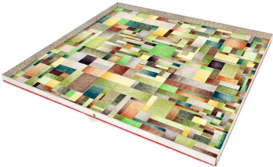
Fig. 4. Proyecto para plaza pública / Biblioteca abierta III , 2011. Lápiz de color sobre papel / Colored Pencil on paper 84x120cm