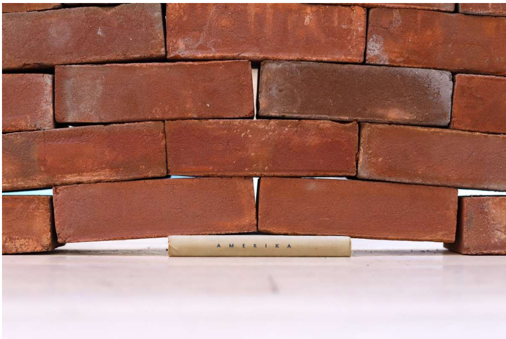
Fig. 5. Amerika , 2019 Ladrillos, edición de "Amerika" de Franz Kafka / Bricks, edition of "Amerika" by Franz Kafka 185.1 x 30.2 x 1016 cm