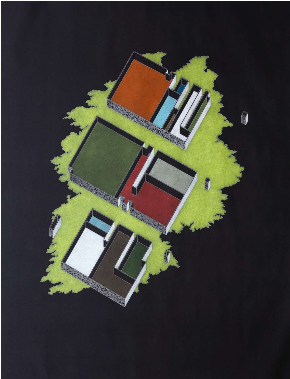
Fig. 1. Ante la ley (Franz Kafka) / Before the Law (Franz Kafka) , 2016 Lápiz de color sobre papel / Colored Pencil on paper 200 x 152 cm

This drawing takes the shape of the text boxes in Kafka's story "Before the Law" as the basic shape for an architectural series of closed spaces.