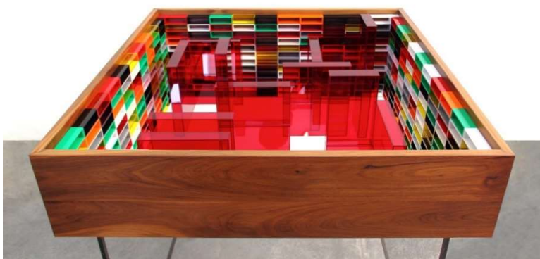
Fig. 2. Proyecto para biblioteca cerrada / Project for a Closed Library, 2014 Madera, metracrilato, metal, espejo / Wood, methacrylate, metal, mirror 100 x 100 x 118 cm