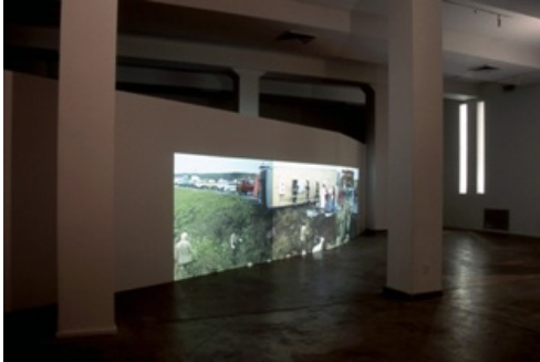
Fig. 4 Aernout Mik, Refraction , 2004, Installation view Museum of Contemporary Art Chicago, USA, 2005, Photography: Michal Raz-Russo, Courtesy carlier | gebauer and the artist.