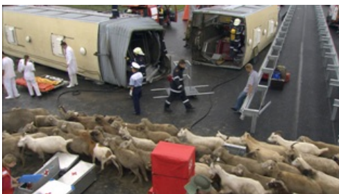
Fig. 6 Aernout Mik, still from Refraction , 2004, dig. video on harddisk, Loop, Edition of 4 + 2 a. p., Courtesy carlier | gebauer and the artist.