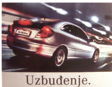
Fig. 2 Antun Marčić, print from the series Cro Car Crash Chronicle, 2001–2002, digital print on graphic paper, 18.2 x 25.7 cm.