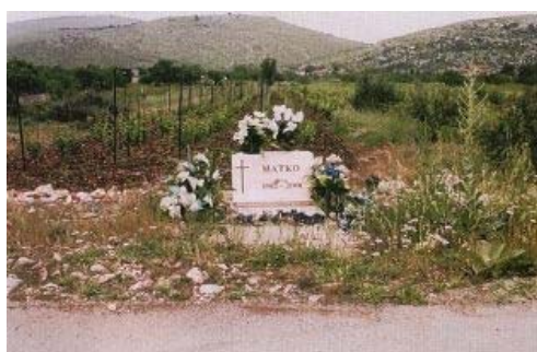
Fig. 3 Antun Marčić, print from the series Usput spomenici/Sideroad Monuments, 1999–2002, colour print, 50 x 60 cm. Courtesy the artist and Miroslav Kraljević Gallery, Zagreb.