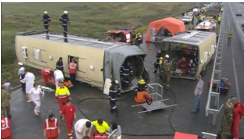
Fig. 5 Aernout Mik, still from Refraction , 2004, dig. video on harddisk, Loop, Edition of 4 + 2 a. p., Courtesy carlier | gebauer and the artist.