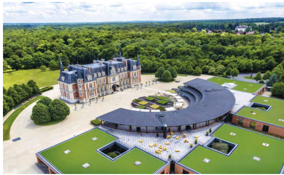
Centro conferenze 'Les Fontaines' a Gouvieux, presso Chantilly (Oise), Francia.

La pubblicazione dell'inedito sia vista dunque come un dovuto omaggio alla memoria di uno dei più grandi, dotti e originali interpreti dell'esperienza giuridica greca, che l'Accademia italiana abbia espresso 13 .