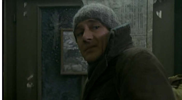
Figure 11. Screenshot from The Castle

Later in the film, when K. returns to the inn and open the door – significantly, a sequence added in by Haneke 26 –, the audience for a moment is given to see the same depiction entirely, before a new sheet of charted paper, which was momentarily lifted by a gust of wind accompanying K.'s entrance, finally falls over the image, covering it completely and allowing only its shadowed outline to shine through (fig. 12-15). Let us remark that, in both these two entrances, the depiction is visible to the spectator's eye but not to K.'s. When he steps through the door, the image remains at his back; he cannot see it, or at least not while we are able to see it. As spectators, we cannot know if he might see it at any other moment. We are allowed to know only fragments of truth.