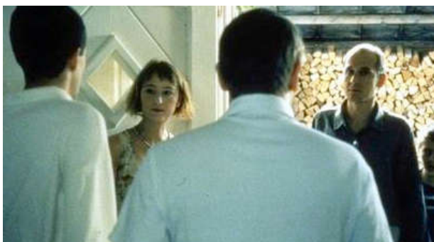
Figure 9. Screenshot from Funny Games (1997)

Thus, Haneke makes no concessions here to what he considers to be TV audience expectations. There is no embellishment in The Castle , no extra-diegetic music or dramaturgical signposting to lead the audience to the 'correct' interpretation, nothing that caters to popular tastes acquired through standardized patterns of enjoyment or entertainment. Just as K., spectators are deprived of any fixed and reassuring point of reference to make sense of what is unraveling before their eyes. Appreciably, it should be empha-