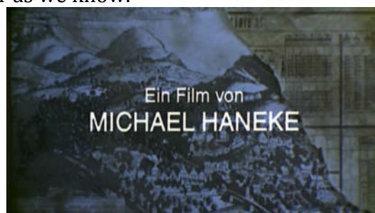
Figure 10. Screenshot from The Castle

Throughout the film, the castle is always presentified by something or someone, but never shown directly, even from a distance. Significantly, Haneke decides against filming even the 'misty void' K. sees at the beginning of the novel. He could have considered, say, setting up an establishing shot showing the haze blanketing the castle, but instead chooses to intensify the sense of distance to the castle by shifting it to a representational level 24 . In fact, the very first frame is an enigmatic depiction that might picture the castle; the spatial distance becomes an iconic distance, a form of presentification through image: when K. makes his first entrance into the inn and the story, the film's opening image (fig. 10) is immediately revealed to be a fragmented picture hanging at the back of the entrance door (fig. 11). It shows what seems to be a small village at the foot of a hill. It might be a representation of the castle (as recalled above, the novel suggests that the castle looks like a «small town») or perhaps one of the village, with the castle possibly hidden by a chart partially covering the image 25 . Or neither, as far as we know.