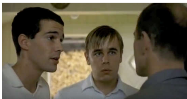
Figure 7. Screenshot from Funny Games (1997)