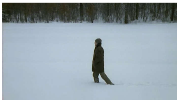
Figure 2. Screenshot from The Castle

In fact, even though castle’s indoor cinematography implies more ‘in-depth’ inspection (fig. 3; 5), it appears clear that going deeper does not lead to the end of the quest, either: zooming in brings us no closer to the ‘truth’ than the lateral motion of the outdoor shots, but rather merely creates new possibilities for fragmentation. This suggests that, as with the outdoor spaces, the indoor spaces might extend into infinity – to say it with Nietzsche, «every cave [...] must [...] have [...] an even deeper cave behind it – a more extensive, stranger, richer world above the surface, an abyss behind every ground, under every ‘groundwork’» (Nietzsche 1886, 173). Hence, regardless of whether our search progresses laterally, through tracking shots, or in profundity, by zooming in, there seems to be no final point representing the source or goal of the process in which the spectator is invited to participate.