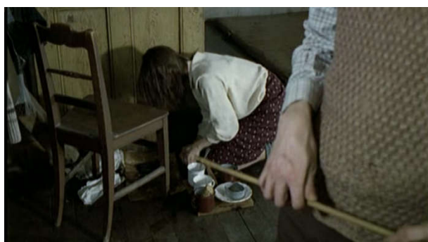
Figure 17. Screenshot from The Castle