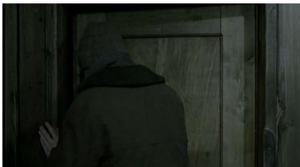
Figure 3. Screenshot from The Castle