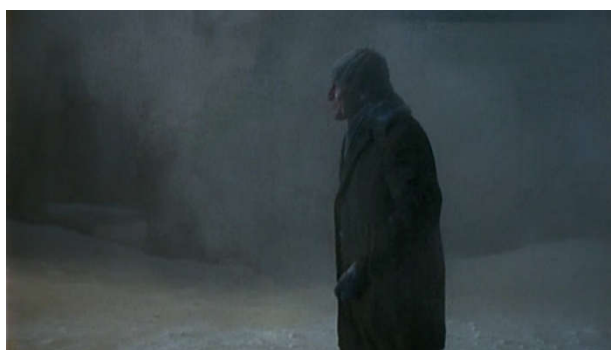
Figure 4. Screenshot from The Castle