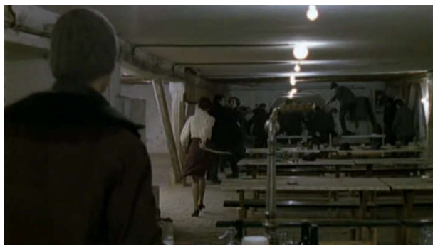
Figure 15. Screenshot from The Castle

make love 30 . Later, once she has become K.'s lover and lost her privileged position with respect to Klamm, Frieda and K. are easy targets for the sadistic instincts of the schoolteacher and his assistant (fig. 17). Characters seem to endure situations like these out of their growing need for recognition.