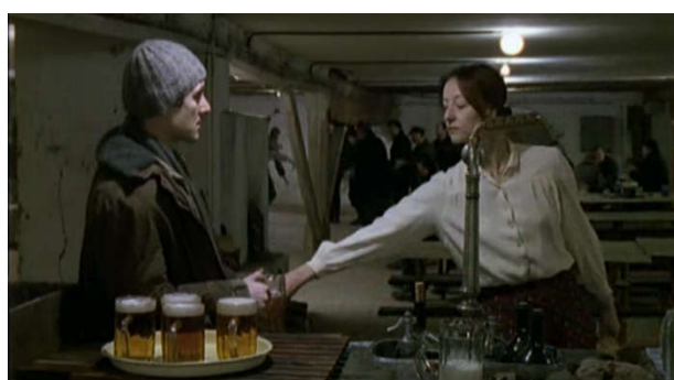
Figure 8. Screenshot from The Castle