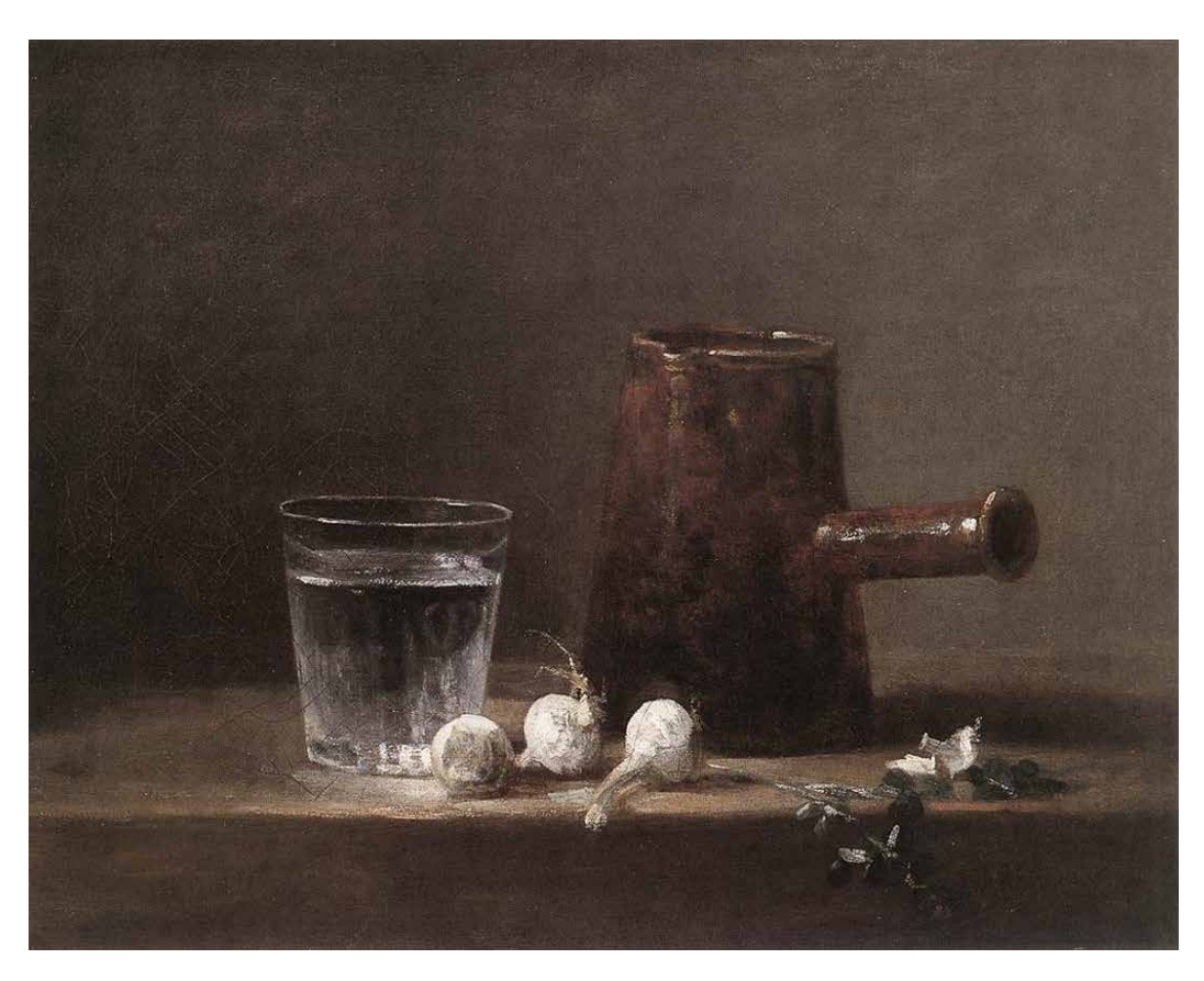
Fig. 1. Jean Simeon Chardin, Water Glass and Jug, ca. 1760, Pittsburgh, Carnegie Museum of Art.

The mastery of light is also the prerogative of cinema. However, contrary to 18th century painting which had a tendency to freeze water and insist on its reflective qualities, early cinema displays a fascination with its movements, especially if they appear to be out of control. In the Lumière's films, water is either discreet and playful as shown in the famous Sprinkler Sprinkled (1895) or, on the contrary, taking up the entire surface of the screen, merging the film roll and the sea in a single materiality like in View no 11: The Sea (1895). Later, in filmic history, Teresa Weenberg and Suzanne Nessim continue to play with the graphic properties and cinematic potentialities of the surface of water. In Swimmer (1978), the rectangular frame of the screen is doubled by the artificial frame of the pool as a way of controlling the volatility of elements, whether water or electronic snow. The editing alternates between wide shots of the water in which we observe the swimmer moving, and close-ups filled with splashes and focus on aquatic material often superimposed with openings of the swimmer's body presented in strange and affected poses.