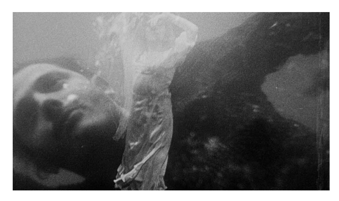
Fig. 2. Jean Vigo, L'Atalante , 1934, still from film.

Nevertheless, the aforementioned Lumière's first movies give water a central role. The passion of the two brothers for means of transportation encouraged them to film not only trains but also boats, whether battleships like the Fürst-Bismarck (View no 785: Kiel: The Launch of the Fürst-Bismark, 1897) or smaller boats such as in the bucolic Boat Leaving the Port (1897). It is the same fascination for marine equipment that led French filmmaker Jean Vigo to make a barge sailing to Paris the main character of his movie L'Atalante (1933). If the landscapes passed by on the banks and reflected into water transform the Atalante's journey into a real mise en abyme of the movie's progress, the movie is interesting for its famous underwater sequences. During one of the key moments of the film, the captain of the boat throws himself overboard. This is followed by a 2-minutes underwater scene where he whirls around in front of the camera with the superimposed image of his lost wife in her wedding dress, floating in the depths of the river (Fig. 2).