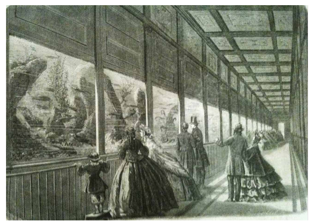
Fig. 3. Bertrand, The aquarium of the Jardin d'Acclimatation, in "Le Monde Illustré," January 10, 1863.

marine aquarium is particularly interesting because it featured reservoirs not only on the sides, but also on the ceiling of the cave, which gave visitors the vivid impression of being both under the earth and under the sea, a sensation strengthened by the mise en scène of the space bathed in silent obscurity and covered by stalactites such as those found in coast caves. The idea was to experience new physical sensations by immersing the body in a peculiar environment, to disconnect visitors from their usual reality and have them dive in an environment they would otherwise never have access to.<sup>35</sup> Not only was this aquarium a cinematic experience, a moving light image experiment, it was also in itself an installation in the most contemporary meaning of the word: an all-encompassing environment.