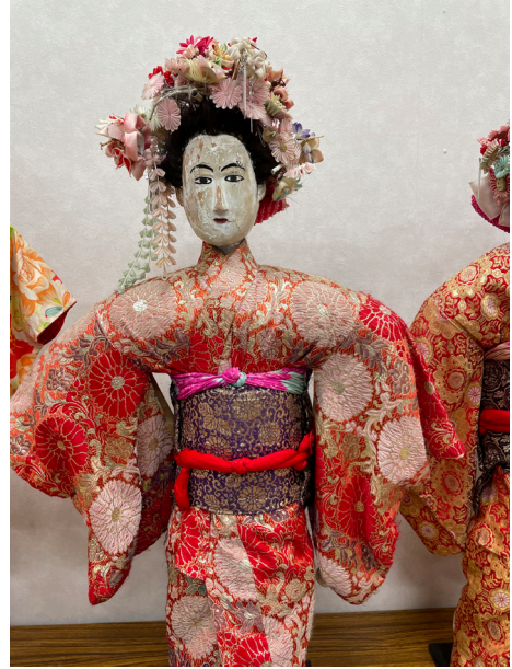
Fig. 12. One of Fukaze's older puppets from storage; a young girl wearing a brocade silk kimono and hair ornaments.