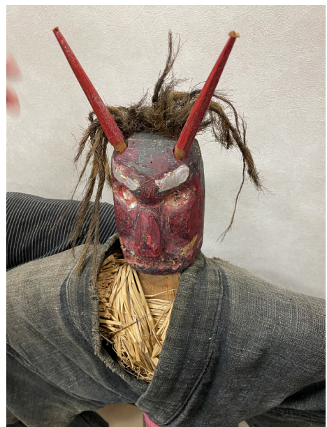
Fig. 14. One of Fukaze's devil puppets.