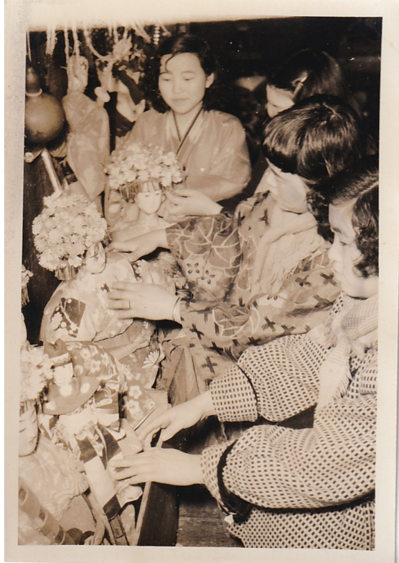
Fig. 9. The women of Fukaze village have long enjoyed and taken pride in dressing and caring for puppets, especially the headdresses and kimono of the female figures.

The women of Fukaze have long enjoyed and taken pride in dressing and caring for puppets, especially the headdresses and kimonos of the female figures [Figure 9]. As Yurika shared with me in e-mail correspondences over several months in 2023, in preparation for a special program in Hakusan in October that brought the remaining bun'ya troupes from around Japan together for a festival of performances and discussions, Katsuki Hisayo bought new kanzashi (hair