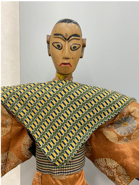
Fig. 13. An older Fukaze puppet from storage with a fancy, brocade, kimono.