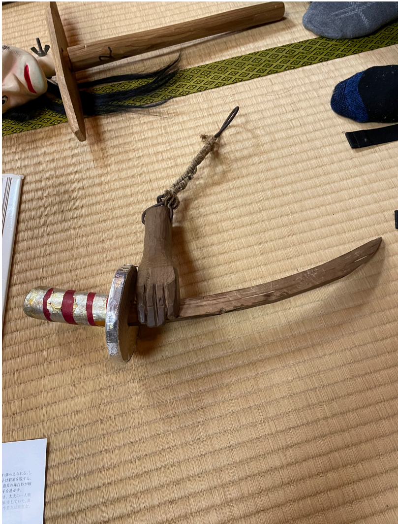
Fig. 6. A Higashi Futakuchi troupe's experiment for replacing use of the performer's hand for their puppets' right hand. The system proved too cumbersome for performance and was not adopted.

different kinds of movements. The simplicity of a puppeteer's direct engagement with and manipulation of a figure, without mechanisms, however, can sometimes be not only easier but more expressive than the use of elaborate devices. It is inspirational to see how much liveness and action Fukaze players get out of puppets that have so little flexibility built into them [Figures 6-7].