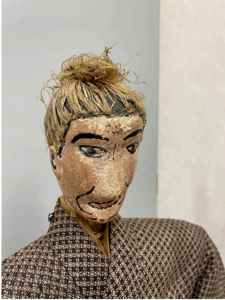
Fig. 11. One of Fukaze's older puppets from storage; a figure of an old man.