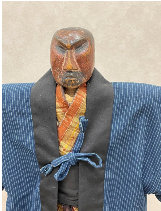
Fig. 10. Presumed to be the oldest puppet in the collection, today a replica of this character is used for the kōjō , or prologue introducing the performance.

While Fukaze's puppets certainly represent the familiar cast of character types common to the Japanese puppet stage – warriors, villagers, noblewomen – along with some devil figures, each seems to express an individual personality in its carving and painting [Figures 10-14].