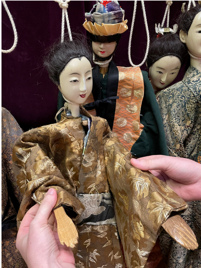
Fig. 5. One of Higashi Futakuchi's female puppets, with two hands, hanging backstage at the troupe's studio.

Higashi Futakuchi's puppets also have a simple trigger mechanism on the vertical pole – similar to those commonly seen in bunraku and other traditional Japanese puppets – that allows the performer to move the character's head up and down by means of a lever, here operated by the performer's thumb. At their beautiful, well-equipped studio and performance space in their mountain village, the head of the Higashi Futakuchi Bun'ya Traditional Puppet Theatre Preservation Association, Michishita Jinichi,