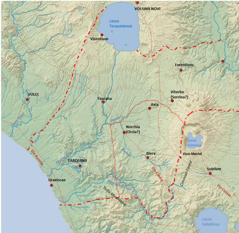
Fig. 1. Hypothetical maximum extent of the Biedano region within the ager Tarquiniensis (after OLSSON 2021, p. 87, fig. 20)