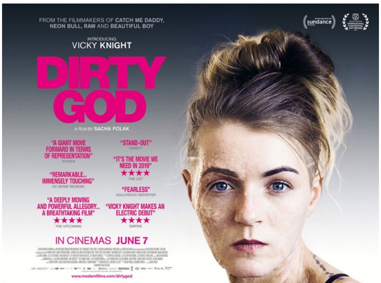
Fig. 3 Dirty God quad poster, 40 inches x 30 inches (UK)

In an industry where disfigurement marginalisation is commonplace, casting an actor with burns to play a character with burns feels oddly radical. [...] As someone with a facial disfigurement, there is often a sense that our stories don't belong to us, and that our faces and bodies only exist as tropes in movies to elicit fear or pity. 65