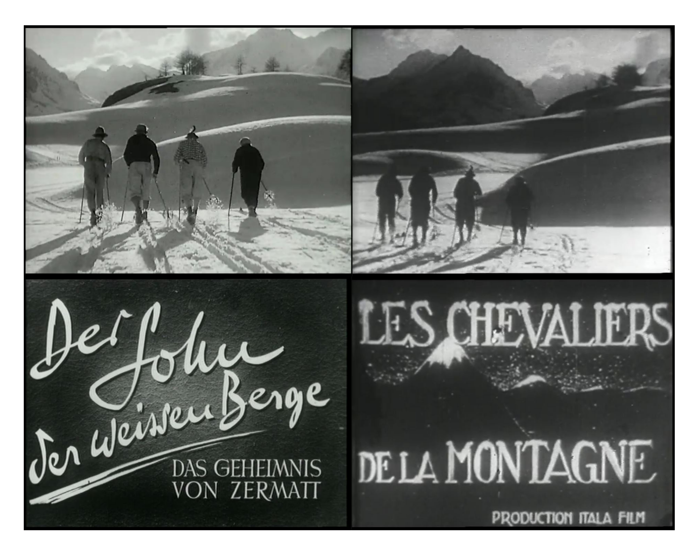
Fig. 2 Beginning of SwB and CdM .

Fig. 1 Ending of the first sequence of SwB (links) and CdM (right).