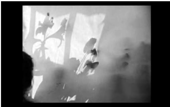
Fig. 2. – Tom Tom, the Piper's Son (Ken Jacobs, 1969-1971).