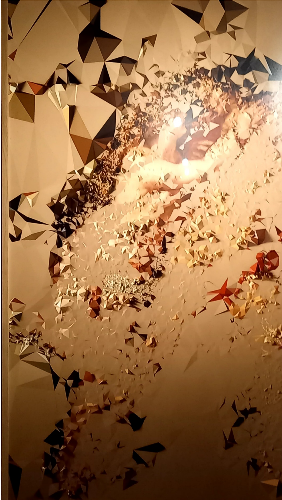
Fig. 3. Davide Quayola. Iconographies #16: Venus and Adonis after Rubens , 2016. Photo Susan Broadhurst, 29 th September, 2021.