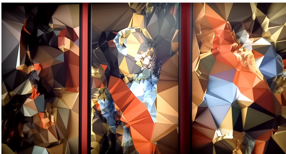
Fig. 2. Davide Quayola. Iconographies #81: Adoration after Botticelli , 2016. Photo Susan Broadhurst, 29 th September, 2021