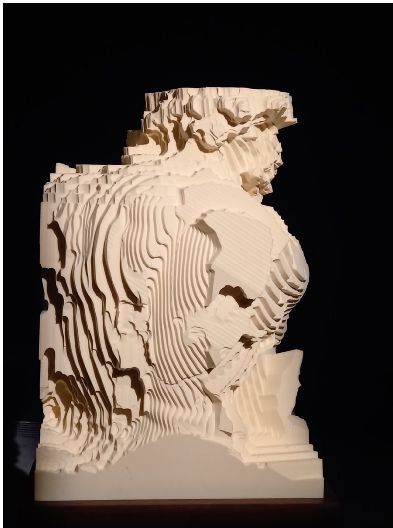
Fig. 7. Davide Quayola. Pluto #F_03_S4 , 2020. 29 th September, 2021.

This is a show which deserves attention beyond Italy, and, when briefly talking to the artist, I was surprised to learn that, when in London, he was not represented by a gallery (perhaps an indicator of the implicit narrowness of tastes there). I look forward to seeing where his next directions lie. Perhaps the future will entail the abandonment of historical anchorages altogether. I am repeatedly prompted to think that the early proposals of modernist theorists were ahead of the technological means to realise them. It may be that such an accom-