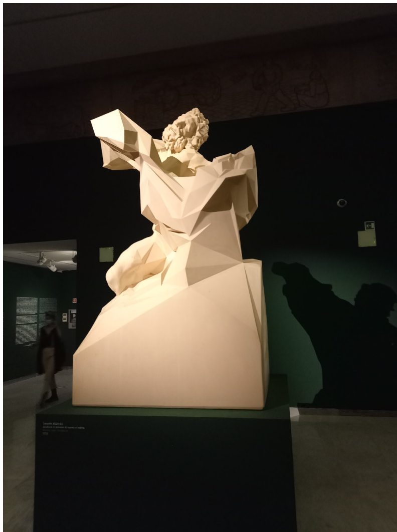
Fig. 6. Davide Quayola. Laocoön #D20-Q1 , 2016. Photo Susan Broadhurst, 29 th September, 2021.

His sculptural works imprison digitally produced fragments of the Laocoon group (that centerpiece of the Vatican Museums' sculpture court) enclosed by modernist devices, in a way, which could be reminiscent of Michelangelo's unfinished " carceri ", but with more originality than mere evocation.