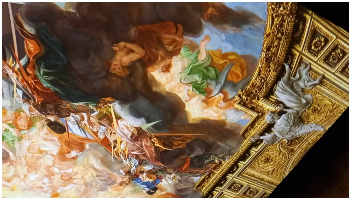
Fig. 1. David Quayola. Strata #1 , 2008. Photo Susan Broadhurst, 29 th September, 2021.