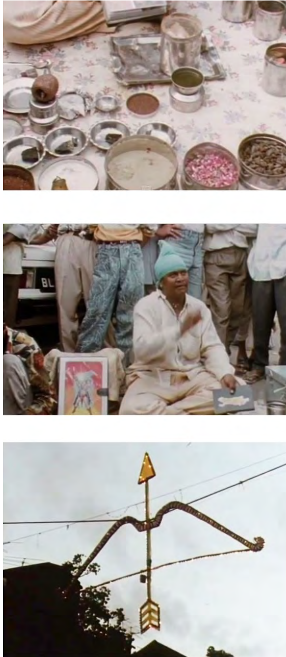
Fig. 5. Stills from Father, Son and Holy War , dir. Anand Patwardhan 1995; Part 2: Hero Pharmacy; from above, a, b, c.