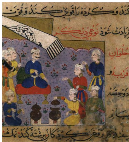
Fig. 4. Illustration from Nīmatnāma , 15 th century Cookery Book. Sultan of Mandu watches preparation of aphrodisiac food (British Library IO Isl 149, f. 133b).