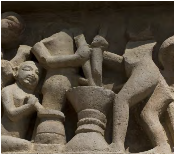
Fig. 8. Detail of Fig. 7: three naked Jain monks cooking in the centre of the orgy frieze.