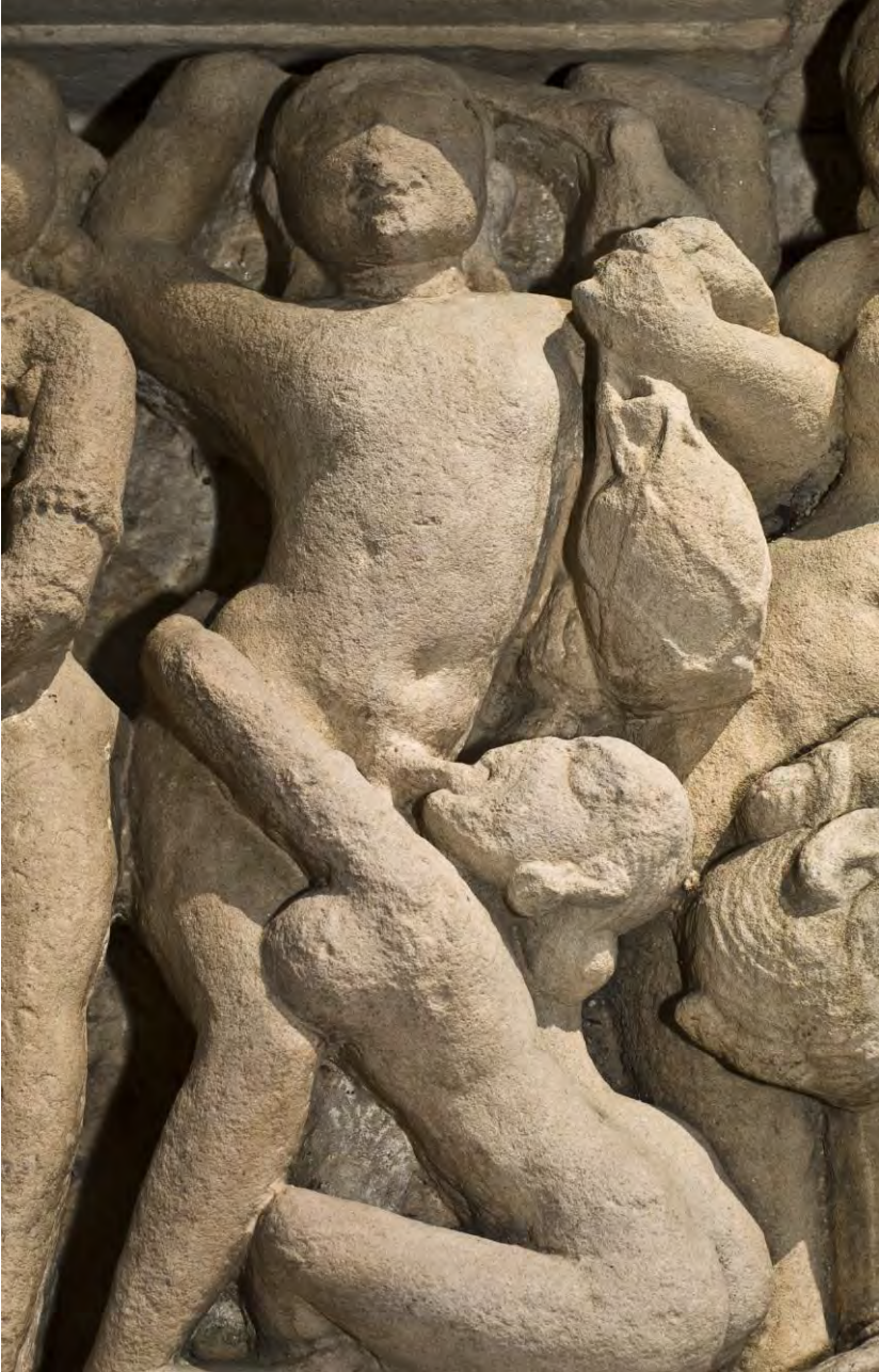
Fig. 9. Detail of Fig. 7: naked Jain monk lifting up an oversized water-vessel in a containing net.