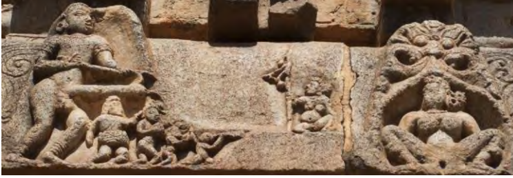
Fig. 6. Relief sculpture from south wall of śikhara , Kalleshvara temple (12 th century), Bagali, Davangere District, Karnataka.