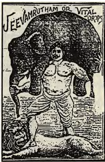
Fig. 3. Aphrodisiac advertisement in Allahabad Leader , 8 th Jan. 1911, showing sexually strong man (from Gupta 2002, 76).