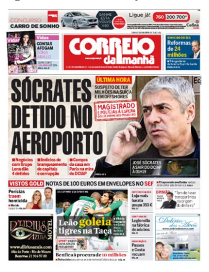
Figure 4 - "Sócrates (former Portuguese Prime-Minister) arrested in the airport" (12/22/2014)