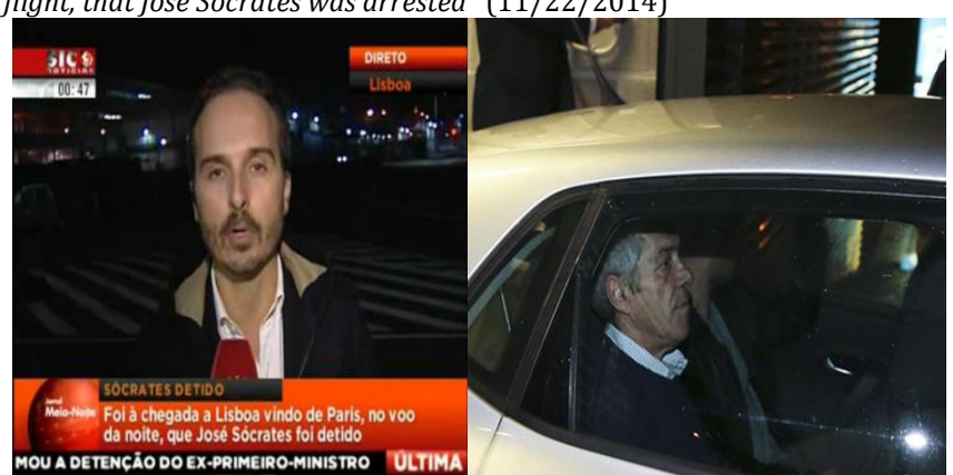
Figure 3 - Arrest of former Prime Minister José Sócrates "It was on his arrival in Lisbon from Paris, on the night flight, that José Sócrates was arrested" (11/22/2014)