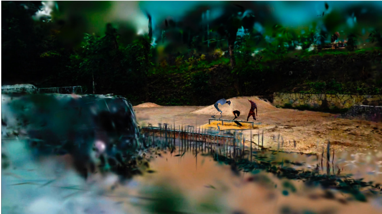
Figure 5. Video still created using 3D scan of the Kingsbridge Skate Park generated through photogrammetry, into which volumetric video images of skaters were inserted. The resulting image includes multiple artifacts and inconsistencies inherent in the technologies used.

(Banmji et al., 2018) on the iPhone 15 Pro we used had a resolution of 0.01 megapixels. Images translated dependent on the type of rendering for viewing. As the technology moves towards similarity to human vision, away from the glitches of the current phase these differences will no doubt be ironed out, but for now they are available as aesthetic tools.