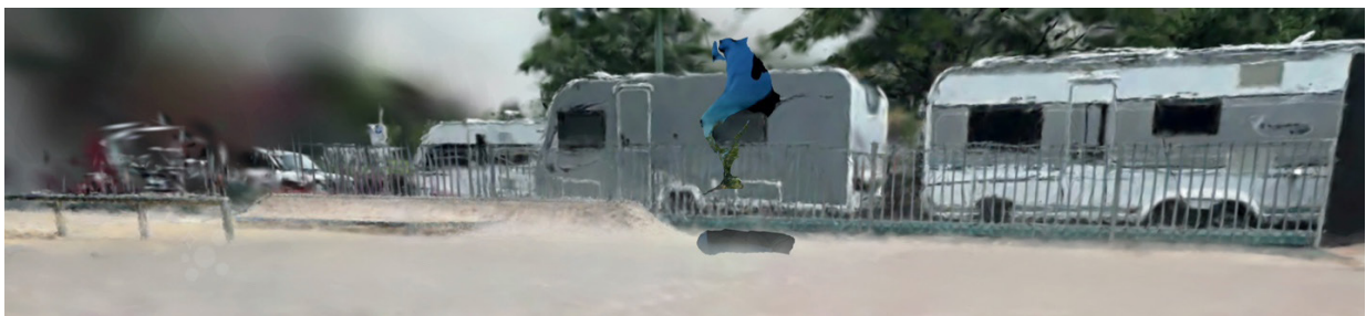
Figure 2. Image created by using multiple technologies. Here the skater is rendered from Kinect data recorded in Brekel, rendered in Houdini and combined with Gaussian Splat image of Kingsbridge Skate Park made on another day.

This is a constructed documentary mode, but one that includes observational imagery. Rather than attempting a faithful rendition of a stable, pro-filmic reality, figure 2 and figure 5 bring together two different temporalities and modes of recording. This is explicit in the imagery itself due to differing qualities of the images that have been assembled 3D but have differing image textures as a result of the sensors and processing technologies. There is wide discussion on the nature of truth in relation to the real in non-fiction film practices for example, Stella Bruzzi (2006) and Trinh T, Minh-Ha (2014). While a full exposition of this debate is beyond the scope of this article, it is worth noting that experimental work in volumetric video forms part of a wider interest in new modes of digital image creation entering into non-fiction storytelling. For example, Constant (2022) by Sasha Litvintseva and Beny Wagner uses point cloud scans and 360 cameras in unusual ways to within a 2D single screen film to tell a critical story about the history of measurement.