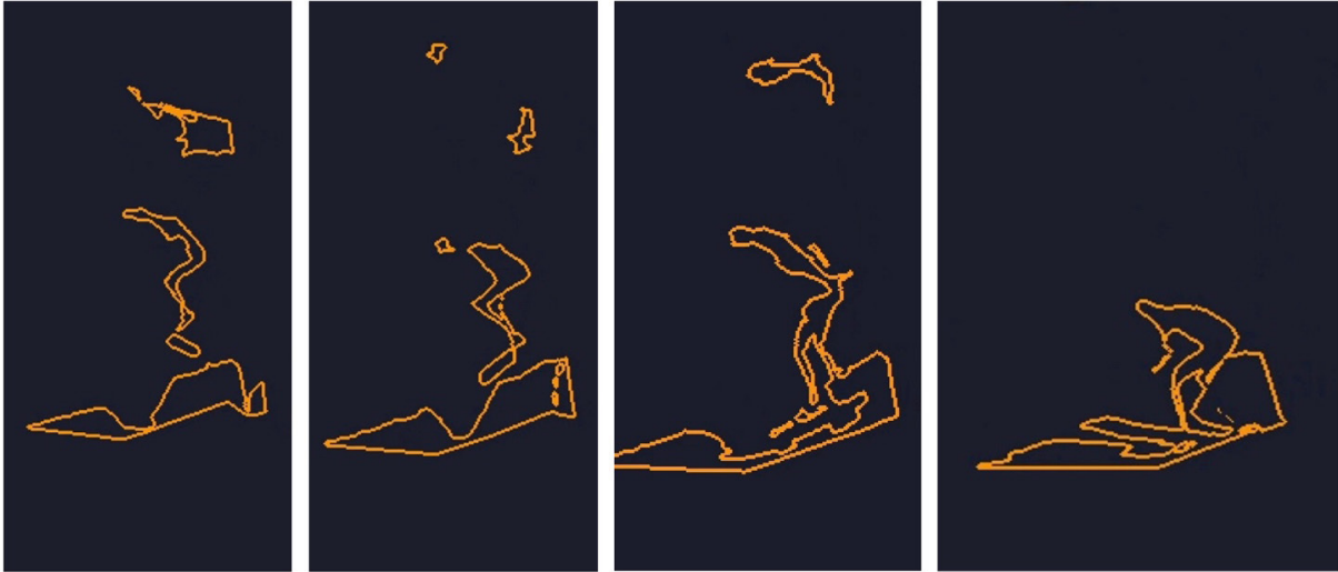
Figure 6. Simplified images emphasise movement.