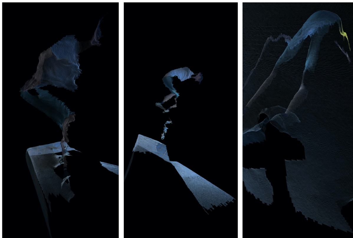
Figure 1. Still Images from volumetric moving-image recording of skateboarder (2024).

research investigates its potential in a mode closer to observational documentary practice. We explore creative possibilities offered by placing this future screen technology on location, and in contingencies within the skatepark. We chose skating as a subject firstly because skaters explore alternative ways in which public spaces of the city can be inhabited beyond their prescribed usage – a bench or curb becomes a means to explore weights, movements and bodies in the city (Willing and Shearer, 2015). Secondly skater culture has a long history of filming themselves and making innovations in filmmaking (Borden, 2017). This situates our study within research that treats the skateboard as a mobile technology and skateboarding as an embodied practice that reconfigures perception and mobility through continual adaptation of body, board, and environment (Hauser et al. 2013).