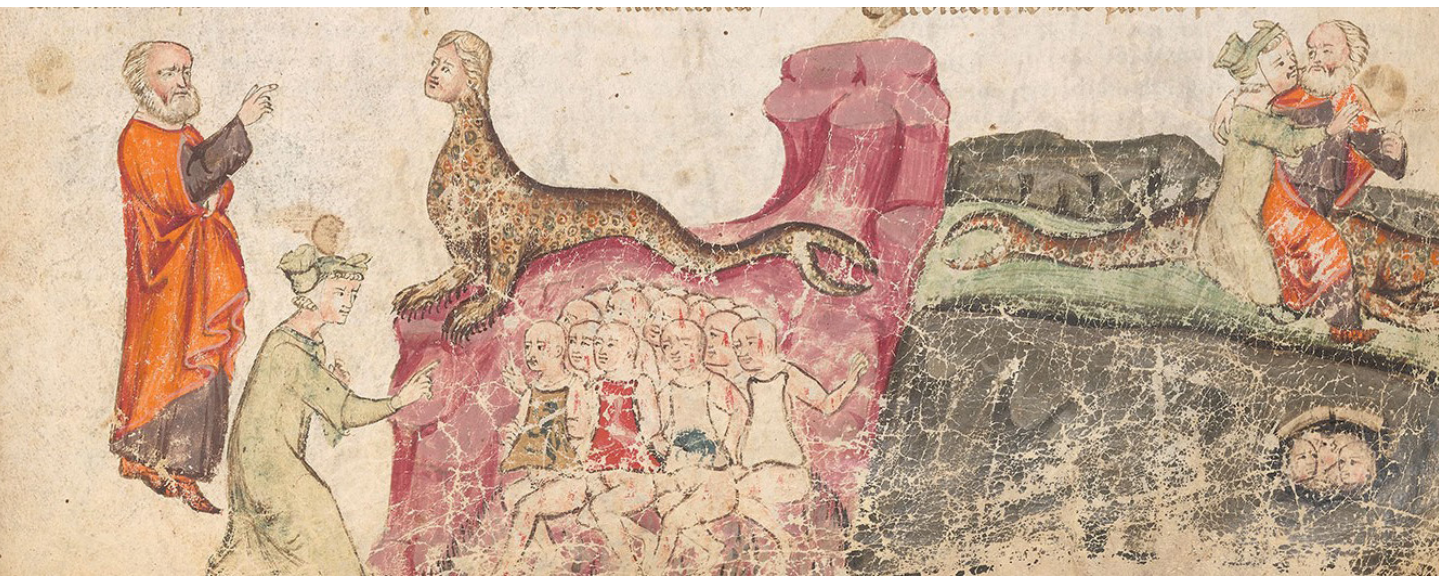
39 Geryon. New York, The Pierpont Morgan Library, ms M.676, f. 27r