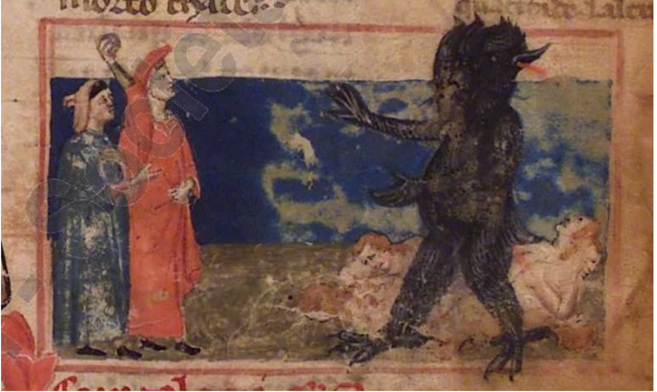
16 Cerberus. Florence, The National Central Library, ms Pal. 313, f. 14r