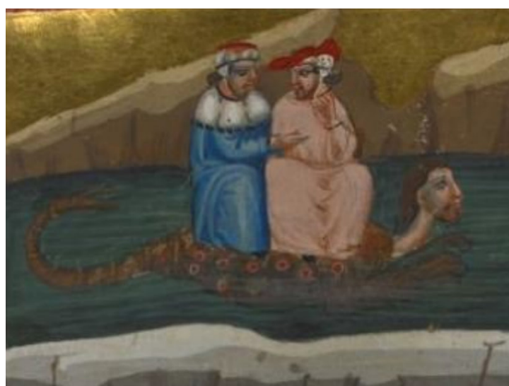
35 Geryon. London, BL, ms Egerton 943, f. 31v