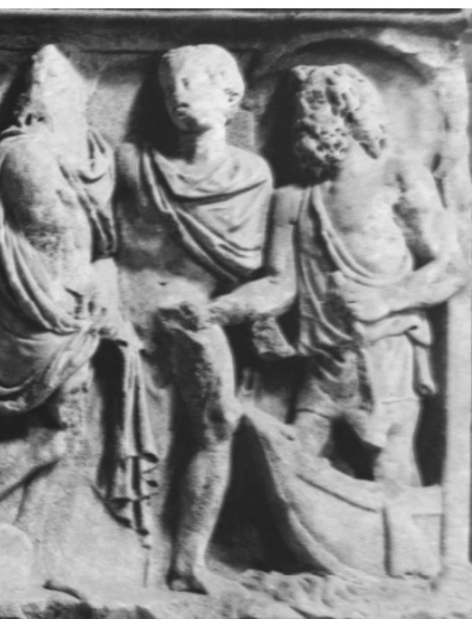
5 Charon (fragment of sarcophagus), c. 170. Museo Pio Clementino, Musei Vaticani