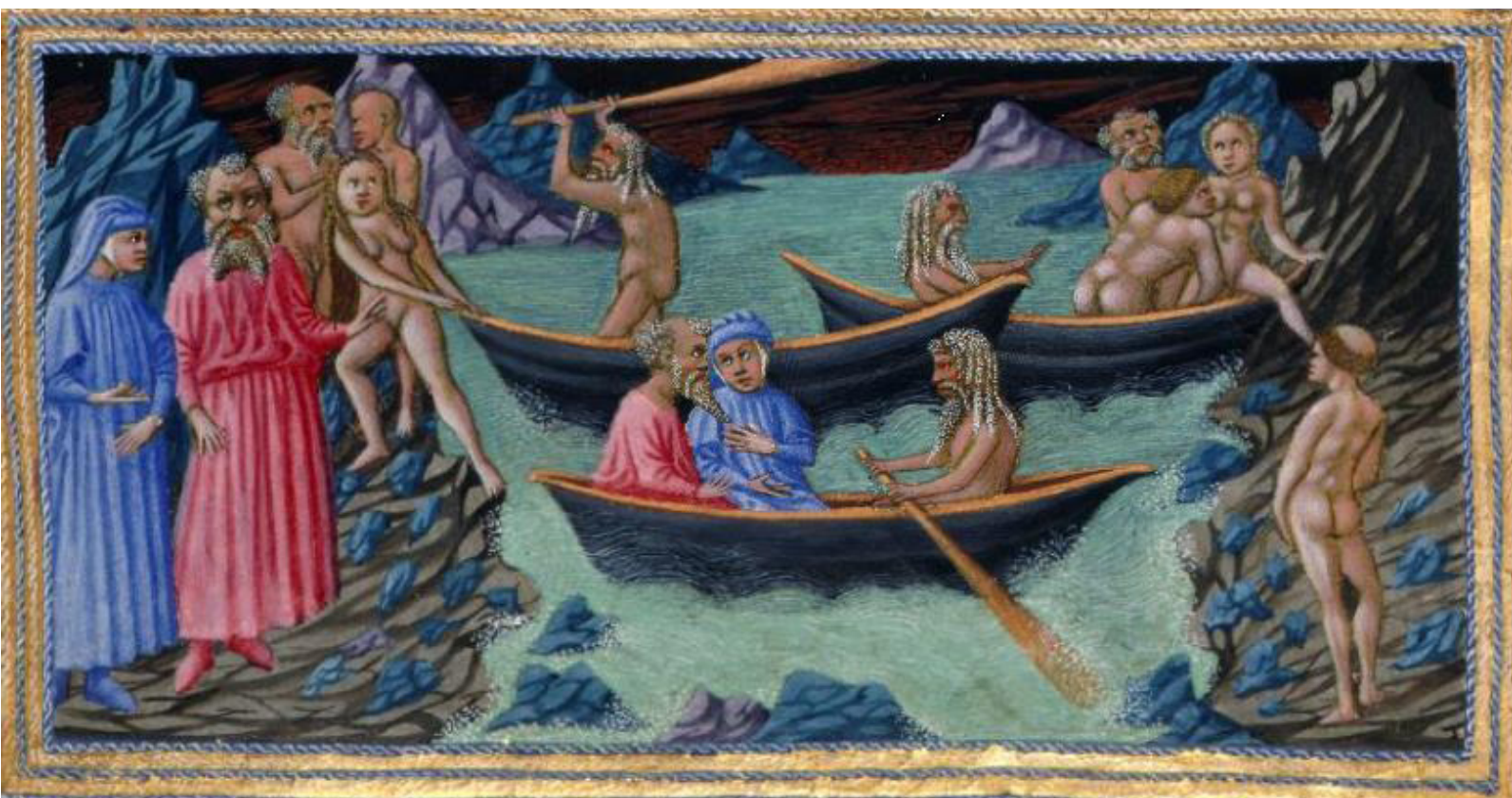
2 Charon. London, BL, ms. Yates Thompson 36, f. 6r