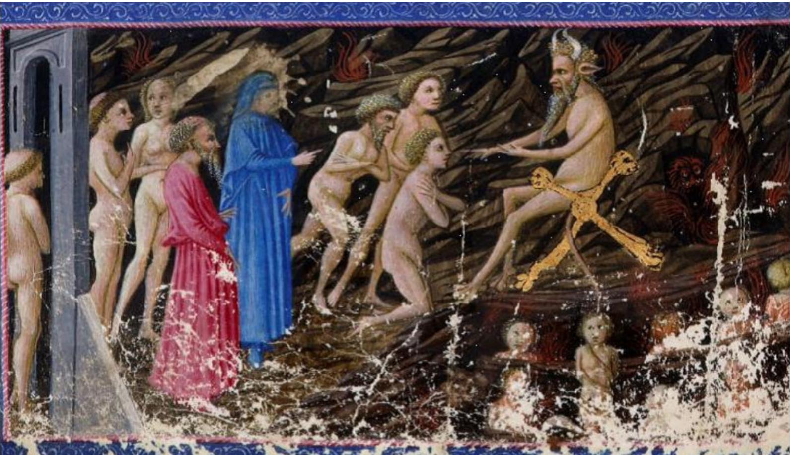
9 Minos. London, BL, ms Yates Thompson 36, 1444-ca. 1450, f. 8v