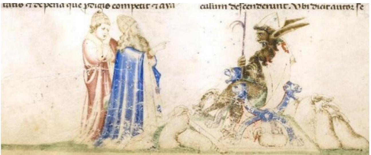
21 Plutus. Chantilly, Bibliothèque du musée Condé, ms 0597, f. 70v