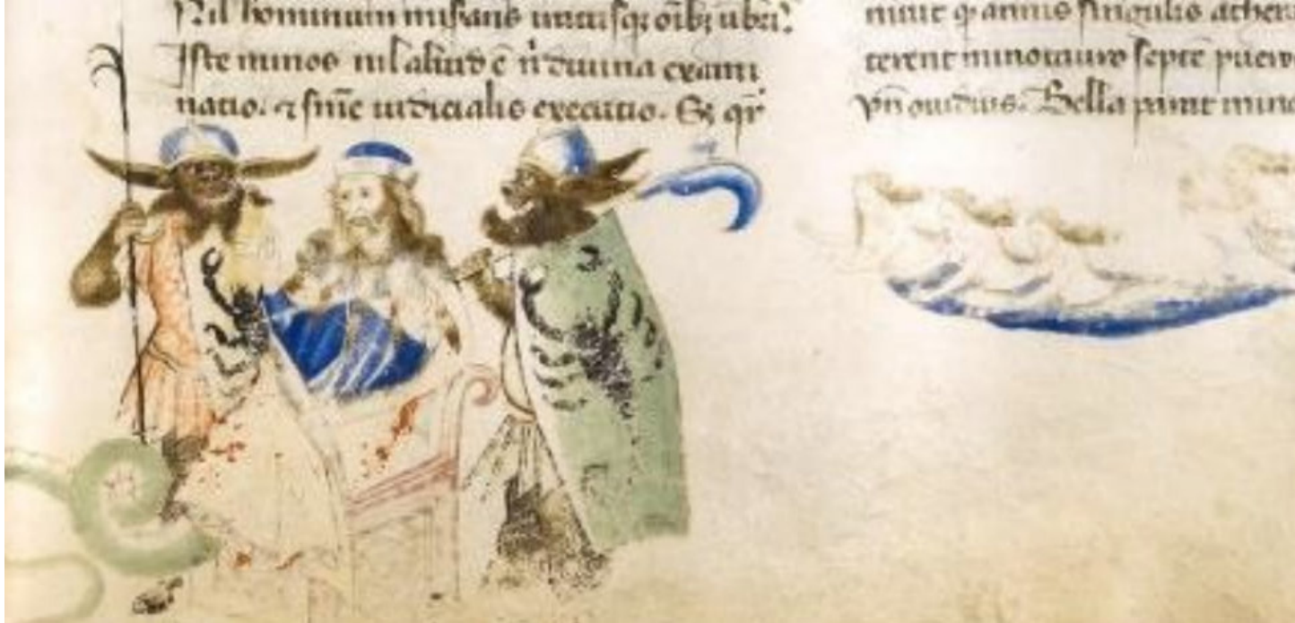
6 Minos. Chantilly, Bibliothèque du musée Condé, ms 0597, f. 61r