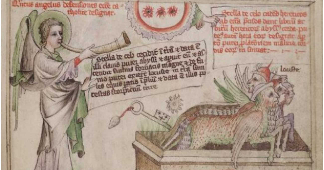
37 Manchester, The Manchester University Library, ms Latin 19, Apocalypse (Rev. 9 3-4), f. 7r