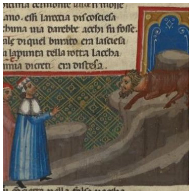
29 Minotaur. London, BL, ms Egerton 943, f. 21v