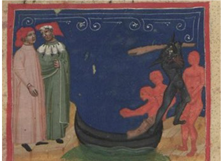
3 Charon. Budapest, Eötvös Loránd University Library, Cod. Ital. 1, ca. 1333-1350, f. 12