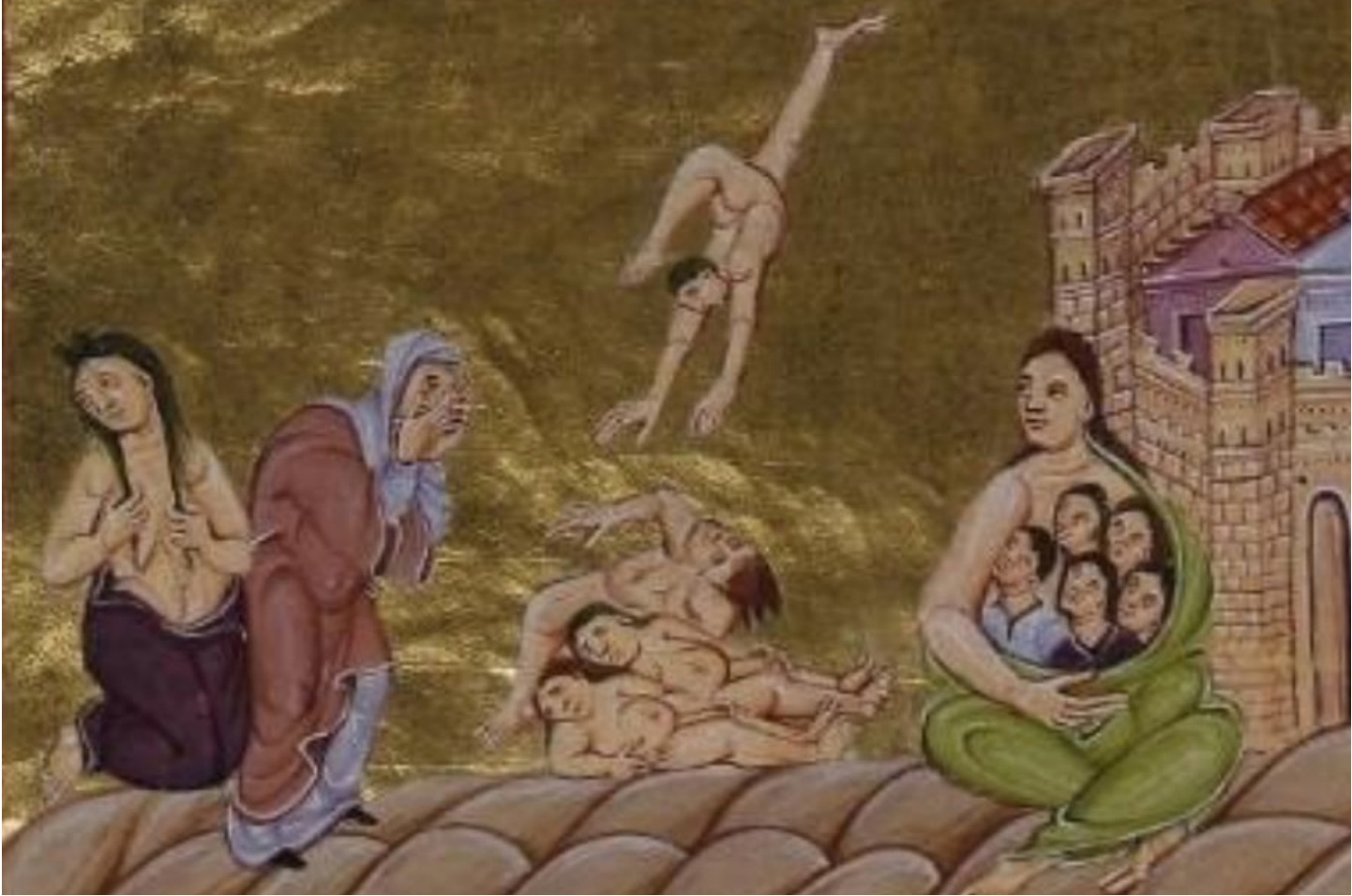
25 The Massacre of the Innocents. Munich, The Bavarian State Library, The Gospels of Otto III, f. 30v