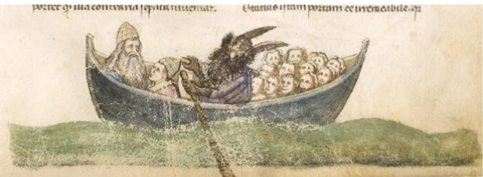
4 Charon. Chantilly, Bibliothèque du musée Condé, ms 0597, f. 50r