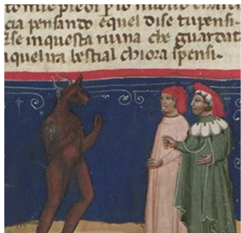
31 Minotaur. Budapest, The University Library, Cod. Ital. 1, f. 26r