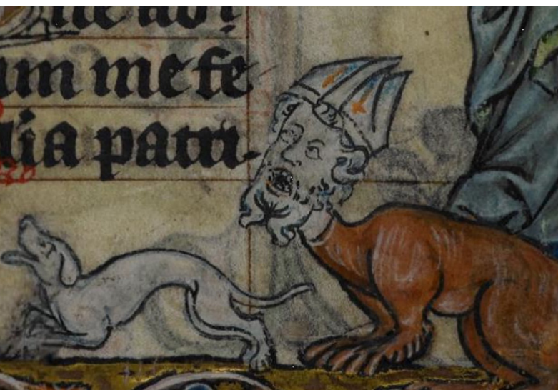
34 London, BL, ms Stowe 17, The Maastricht Hourbook, f. 131r