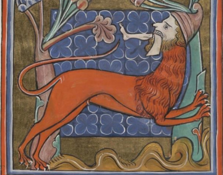
32 Manticore. Oxford, The Bodleian Library, ms Bodley 764, f. 25r