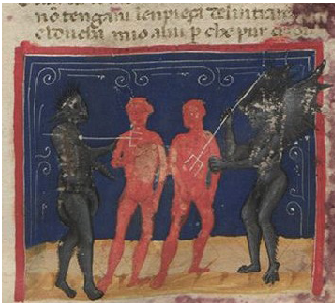
7 Minos. Budapest, Eötvös Loránd University Library, Cod. Ital. 1, f. 14