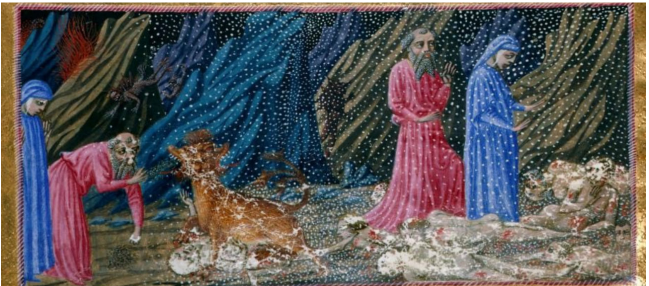
17 Cerberus. London, BL, ms Yates Thompson 36, f. 11r