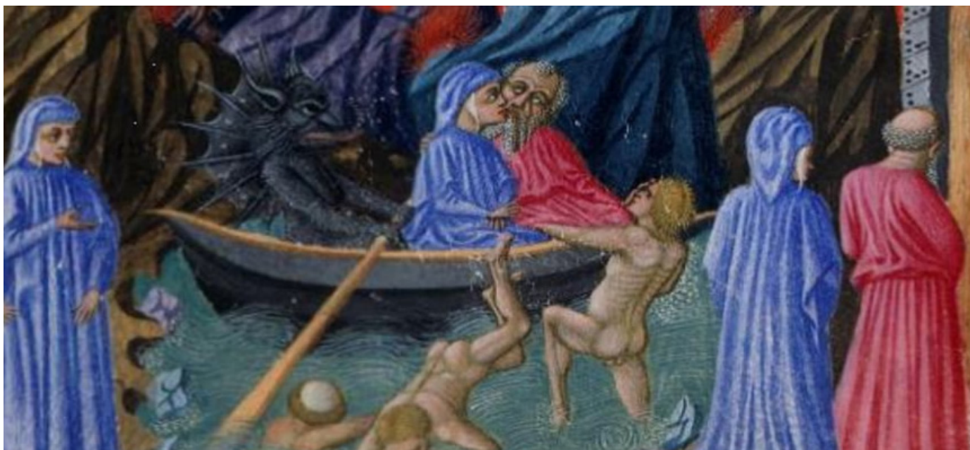
24 Phlegyas. London, BL, ms Yates Thompson 36, f. 14r