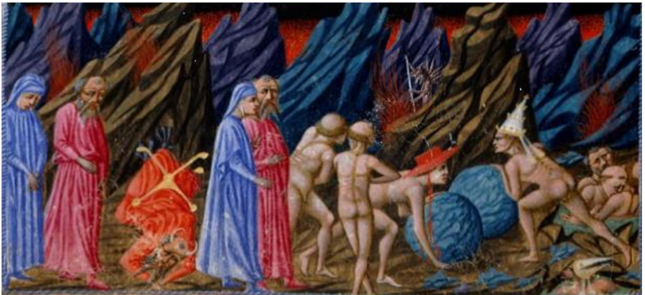
20 Plutus. London, BL, ms Yates Thompson 36, f. 12v