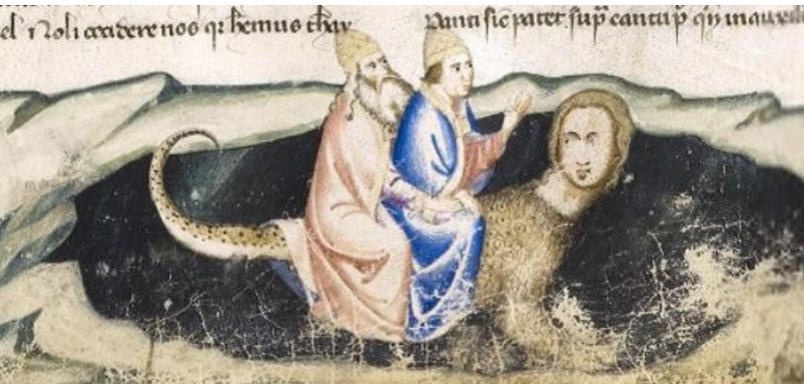
36 Geryon. Chantilly, The Condé Museum, Chantilly 0597, f. 123r