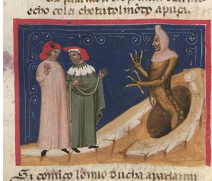
33 Geryon. Budapest, The University Library, Cod. Ital. 1, f. 35