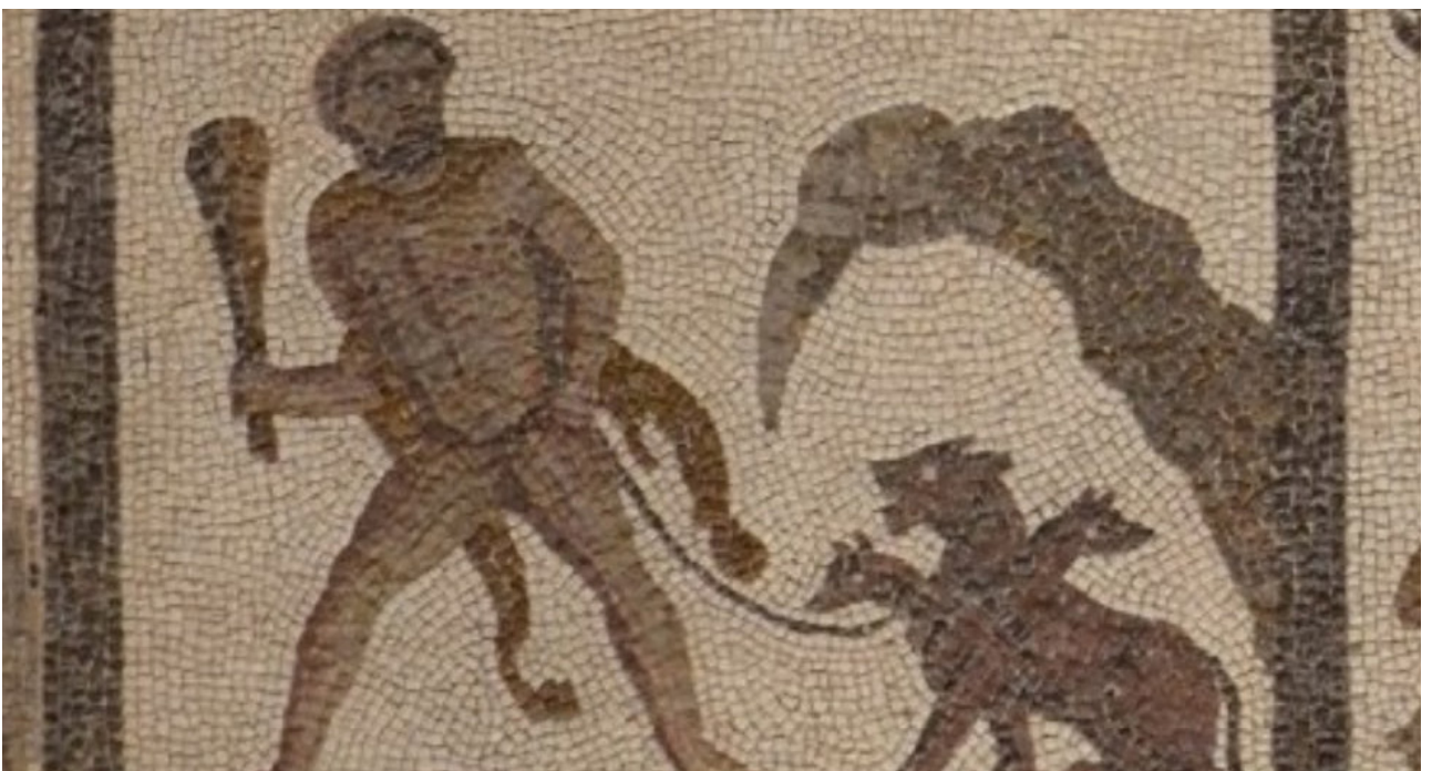
18 Hercules and Cerberus, III century, The National Archaeological Museum, Madrid