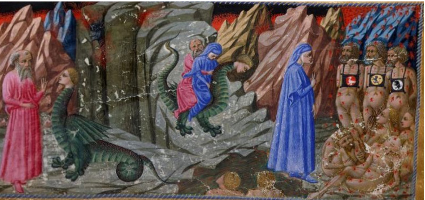
38 Geryon. London, BL, ms Yates Thompson 36, f. 30v