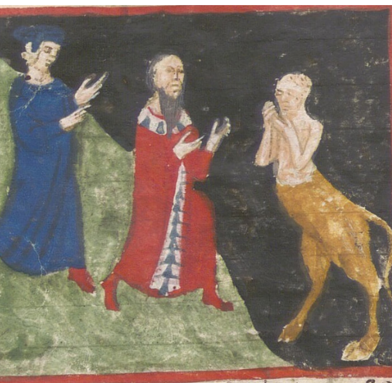
30 Minotaur. Naples, The National Library of the Girolamini Oratory, CF 2.16, f. 28v