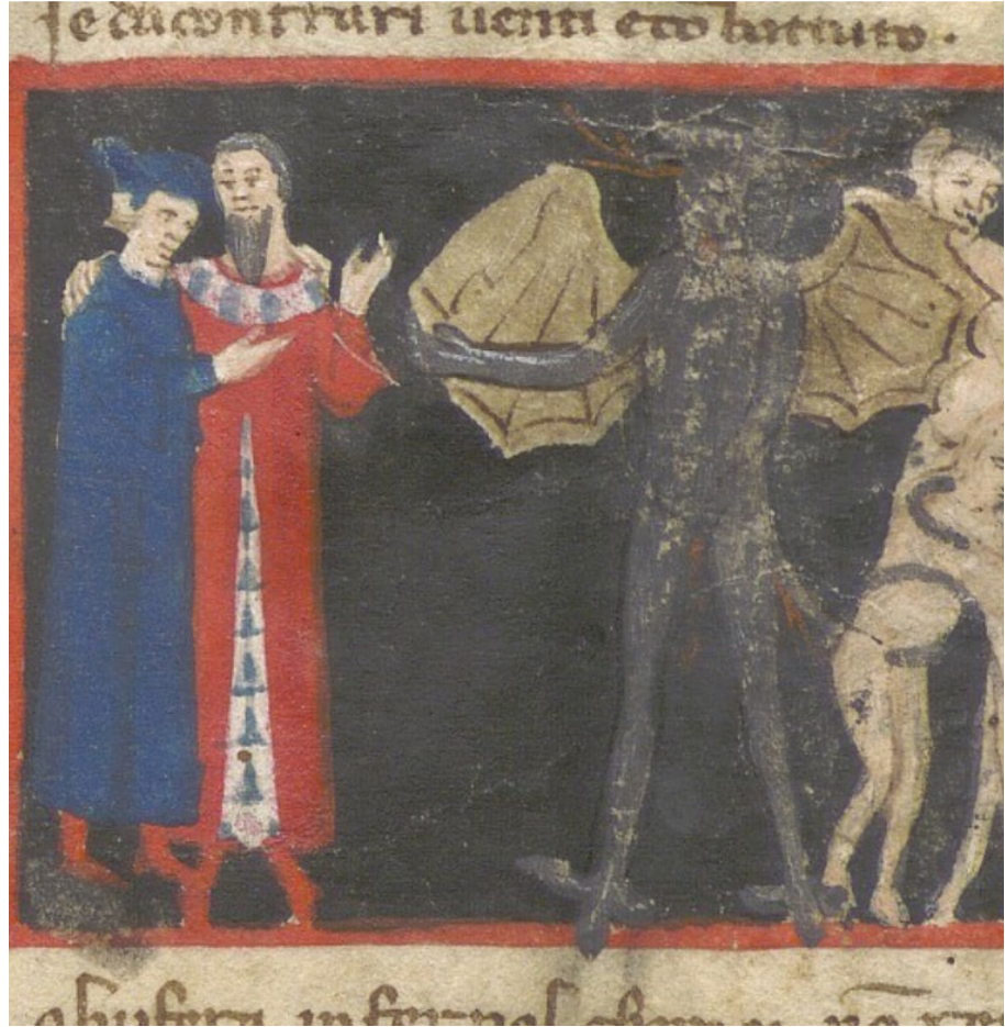
10 Minos. Naples, Biblioteca e Complesso Monumentale dei Girolamini, CF 2.16, f. 12r