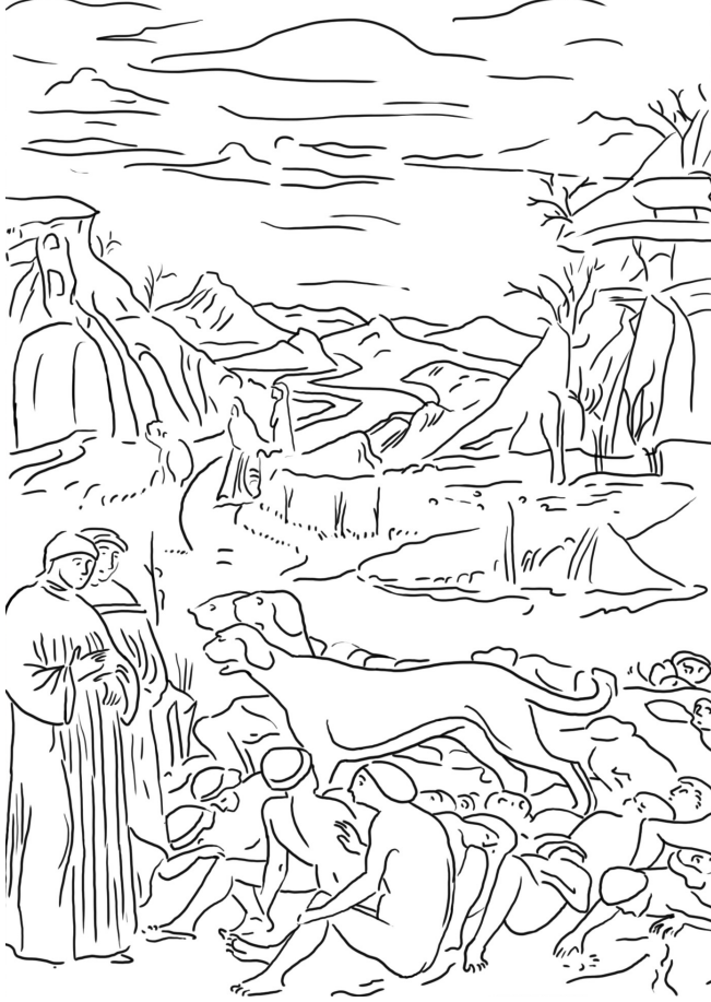
19 Cerberus. BAV, Urb. Lat. 365, f. 15r.