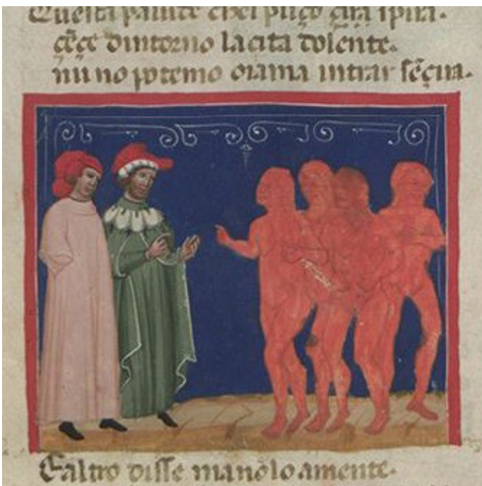
26 Three Furies. Budapest, The University Library, Cod. Ital. 1, f. 22