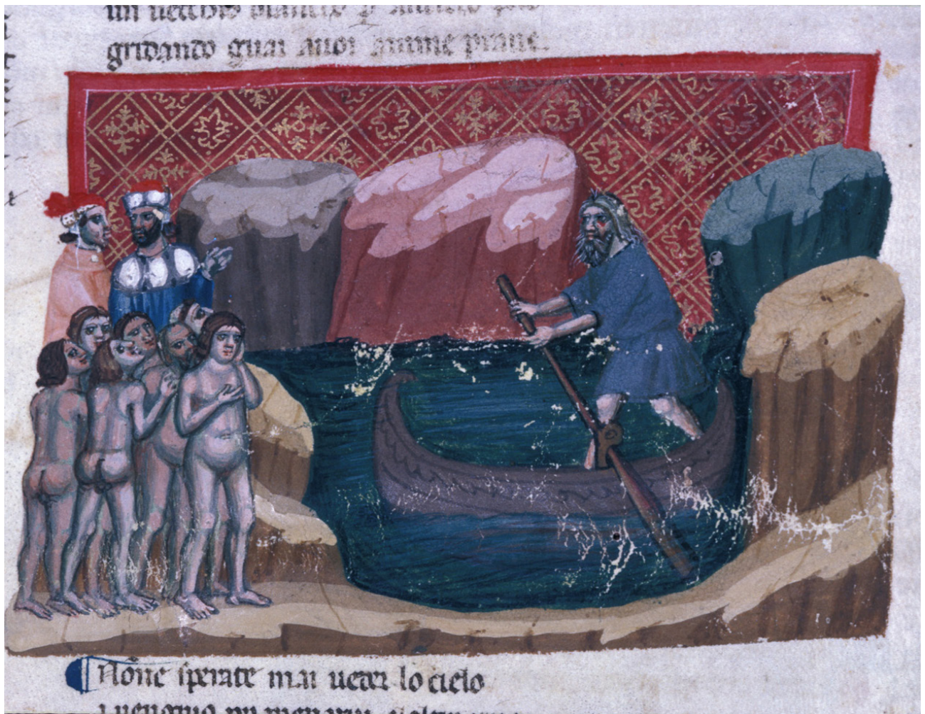
1 Charon. London, BL, ms. Egerton 943, f. 7v