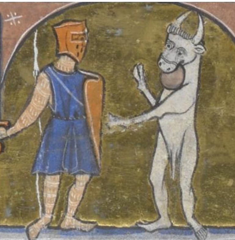
28 Minotaur. London, BL, ms Add 19669, f. 96v