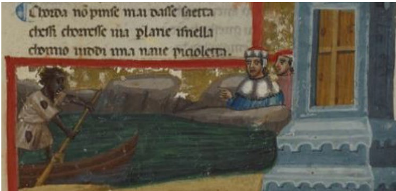
23 Phlegyas. London, BL, ms Egerton 943, f. 15r