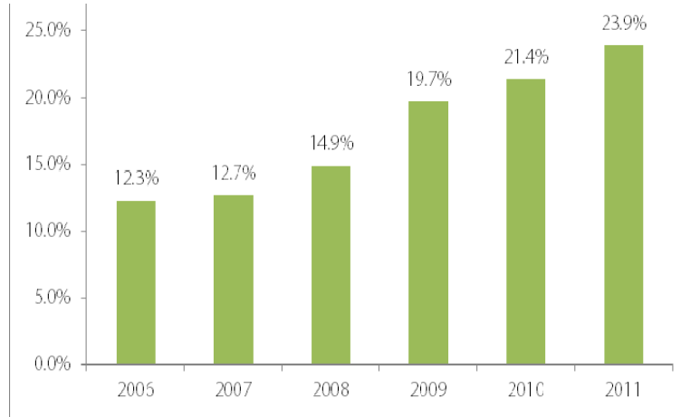
Fig. 2. Unemployment Rate.