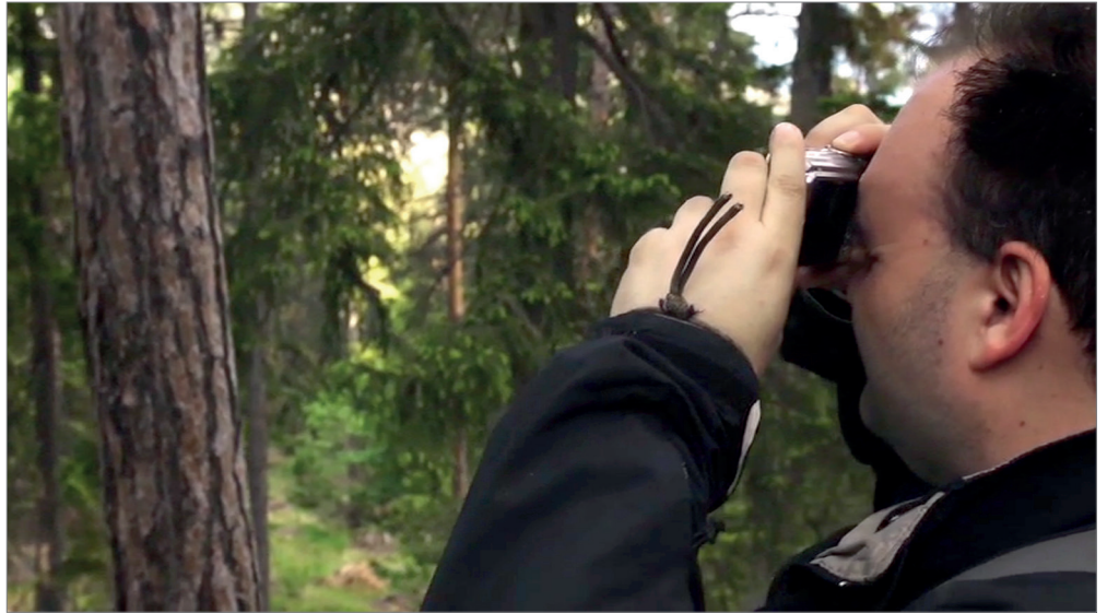
Fig. 2 - Intuiting the image in "Per altri occhi" (2013), Silvio Soldini.

lice to comfortably navigate a previously unfamiliar city, or Giovanni to find his pair of socks and Enrico to remember an old home through the smell of dampness. Pure memory comes to us in less structured, non-habitualized forms, unexpectedly, when we recall something unrelated to our present situation, perhaps in a state of sleeping or daydreaming, like the memory of the blues and greens of a panorama that unexpectedly come back to one of the protagonists and that thus allows him to see the colours he can no longer "see".