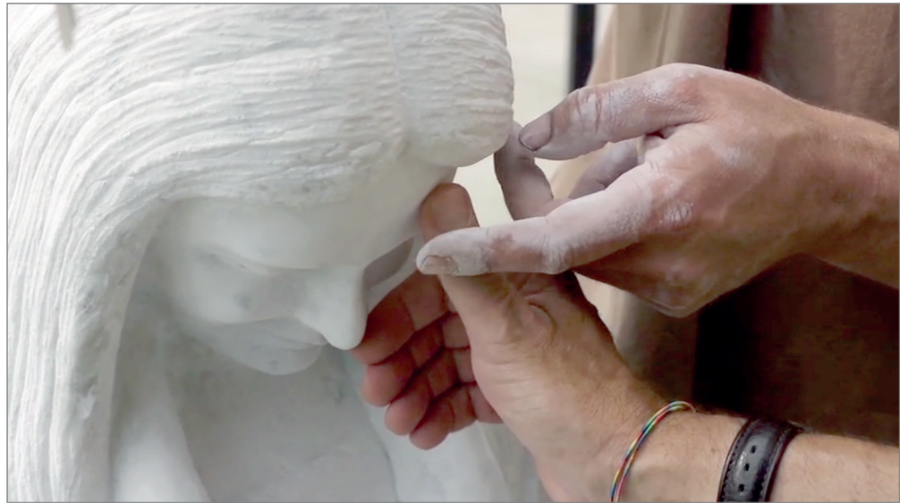
Fig. 1 - Seeing differently in "Per altri occhi" (2013), Silvio Soldini.

The nature of the subject the film explores and of its protagonists mean that Soldini and Garini also embrace different strategies in their filming. In contrast to their previous documentaries, where they remained diegetically “outside”, Soldini and Garini modestly enter the film itself, through their responses to questions or requests heard offscreen and the visual intrusion into screen space – their assisting in a sailing manoeuvre that almost causes a capsize, Soldini’s fingering Felice’s sculpture as he himself experiences “seeing” differently through this active touching ( fig. 1 ). The words (which reach us aurally) or gestures from the margins of the frame break one of the codes of traditional observational documentary that keeps the director outside the text. At the same time this breaking of the code is humbling and levelling; it disrupts the hierarchy between filmmaker and filmed subject and creates the level of intimacy required to enter the protagonists’ physical and psychological spaces.