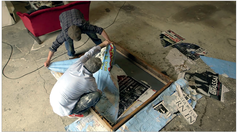
Fig. 6 - Recycling images in "Tre Milano" (2015), Silvio Soldini.

their transcultural issues as they hope for a more tolerant and less racist society. Kirba cycles to one final spot, the Ciclofficina Stecca, in the Isola quarter of Milan, in the shadow of the reflective Unicredit tower and at the end of the road for tram 33. Here the workmanship, creativity and industriousness that is part of the city's history endures as she joins others who want to learn to repair their own bicycles but also to build things with their hands, sawing and sanding pieces of wood destined for use.