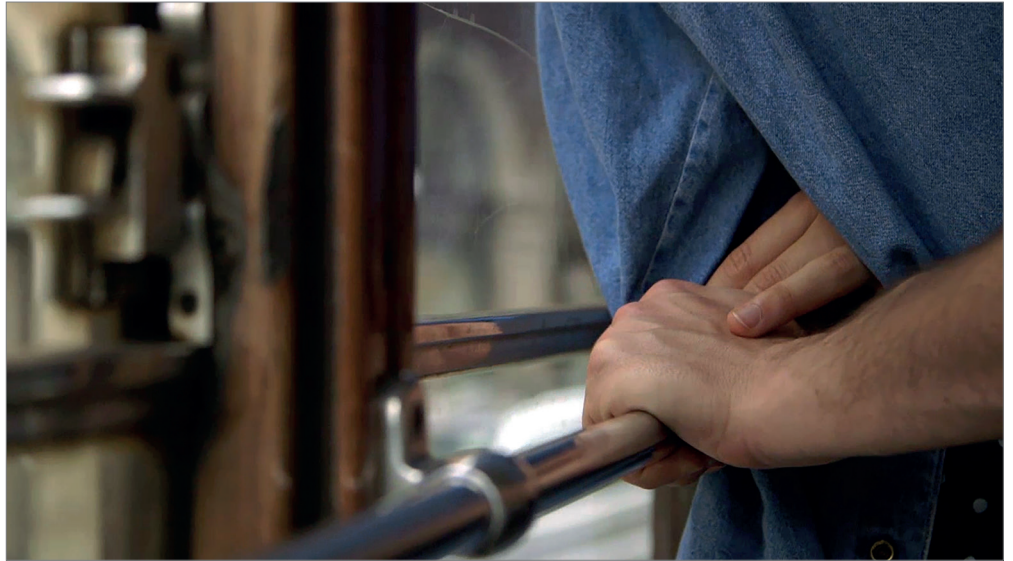
Fig. 4 - The affection of intertwined hands in "Tre Milano" (2015), Silvio Soldini.

and intolerant Milan of Anima divisa in due ; and, following a break, the Milan of the depressed economic years in Cosa voglio di più ( Come Undone , 2011), a city of hour motels and claustrophobic interiors. In Tre Milano , we traverse the contemporary changing landscape of the urban metropolis, a city like Calvino's invisible city of Zaira cited at the beginning of this section, that contains its past, its present and its future in its materiality.