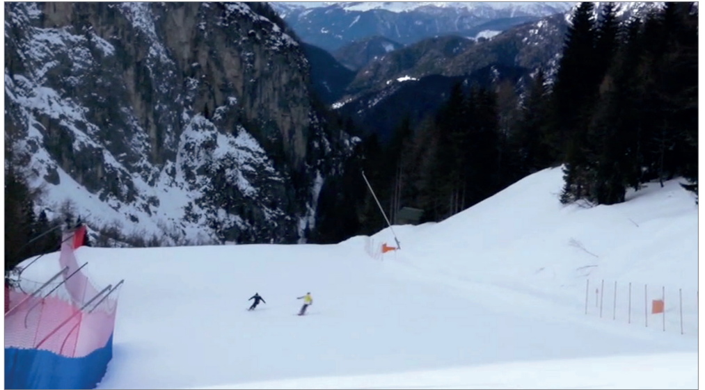
Fig. 3 - Emotion experienced haptically in "Per altri occhi" (2013), Silvio Soldini.

instructor distancing himself from us visually, and we watch him in that imposing landscape, in the blinding white snow. Despite our increasing visual detachment, we can still hear the orienting cries of his instructor, and feel the great sense of liberty that soaring down the mountain allots ( fig. 3 ). This, like so many other scenes in Soldini's film, is one of pure emotion, experienced haptically, transferred from the skin of the screen to the body of the viewer.