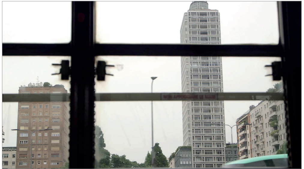
Fig. 5 - Framing and mapping the city in "Tre Milano" (2015), Silvio Soldini.

rects our gazes outside up to the wires that connect the city, and down to street level, the film unfolds Milan's material architectural history, its urban design and transformation. The cranes signal a city under construction, while the cityscape depicts a past that seems to live in an accepted equilibrium with the present, dignified historical buildings coexist with post-war apartment buildings and the new recognizable skyscrapers (from Torre Velasca to the Bosco Verticale). It is a filmic map captured through the frames of the tram window and accompanied by the rhythmic sound of the tram-wheels on the rails ( fig. 5 ).