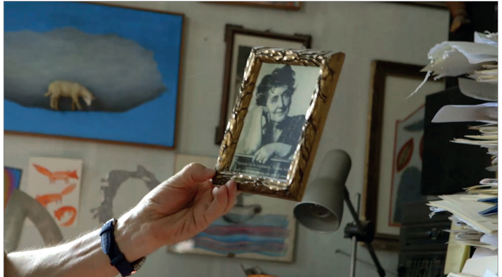
Fig. 9 - Cradling objects in "Il fiume ha sempre ragione" (2016), Silvio Soldini.

That same ethos and passion they dedicate to their art governs every aspect of their lives. Not always focused on the task at hand, Soldini's camera occasionally wanders among the objects and pictures in Alberto's and Josef's studios, objects occasionally picked up and held out toward us, cradled in their hands like old friends ( fig. 9 ). Only occasionally we take a break from this creative activity to observe Josef's city from above or to walk along Alberto's river, the river that evokes an aphorism that becomes the title of the film, the river is always right, an acknowledgement of the natural order of things, of flow and slowness ( fig. 10 ).