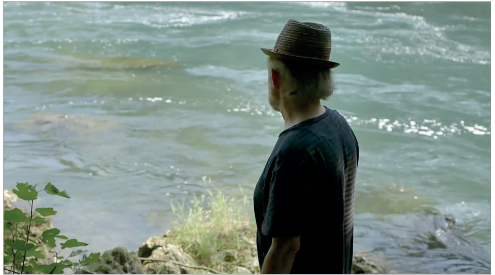
Fig. 10 - Flow, slowness and the natural order of things in "Il fiume ha sempre ragione" (2016), Silvio Soldini.

The gaze does not depend only on the eye, but on all the senses. There are images that should be listened to more than looked at, others that cry out that we touch them, immerse ourselves in them, images that invade us and fill us, that move us, that make us think. The eye in the end does nothing more than find the best image for what the gaze "sees." It searches for a form, a movement, a music to recount that image, something singular and unutterable. 34