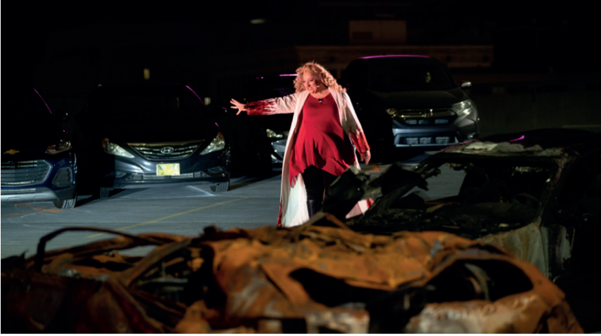
Fig. 4 – Final scene where Christine Goerke performs Brunnhilde’s Immolation scene on the rooftop, among the crushed shells of burnt-out cars.

lation scene on the rooftop level, among the shells of burnt-out car wrecks, departing afterwards in a custom-built white Ford Mustang convertible (see figure 4). Then, Erda’s voice entered, accompanied by the continuous hissing of white noise over the FM radio as she concluded the opera as follows: