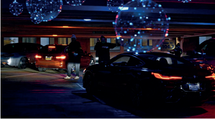
Fig. 2 – Panning shot of cars entering the parking complex right before Scene 1 (“Waltraute’s Story”). We heard a static chord played by a synthesized keyboard, and saw visible stagehands facilitating the event.

figures recur throughout and remain quite visible. 33 As drivers ascended to the next level of the garage, more stagehands and technologists appeared, making no attempt to conceal the operations of changing scenery and ensuring safety.