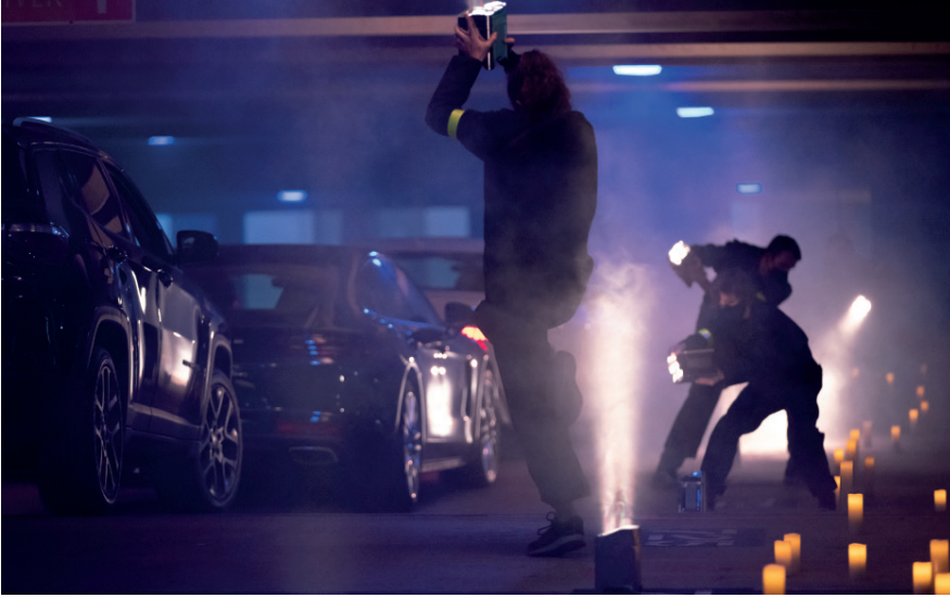
Fig. 3 – Lightshow in Scene 4 (“Siegfried’s Funeral March”) where car headlights, candles, and flashlights emitting various hues constituted the overall visual fabric of the opera.

The stagehands morphed into supernumeraries, into a kind of Detroit Techno ballet troupe. They inhabited the story world and were no longer merely arranging that world’s props and scenery. Audiences, likewise, were no longer passive viewers, but “co-creators” within the operatic setting as they “perform[ed] ‘double-duty’”—as both audiences and facilitators of the performance. 34 Phenomenologically speaking, this scene seemed tailor-made to illustrate Kreuzer’s point—audiences were forced to confront the technology of the performance. The well-lit garage generated a plethora of opportunities for serendipitous performer-audience co-creation of spectacle, which ran alongside the operatic performance. In the process, the mode of reception shifted to the third-person, which allowed one to oversee the event from a distanced perspective. But beyond that, the distracted pleasure engendered by the oscillating interplay between the fictional world